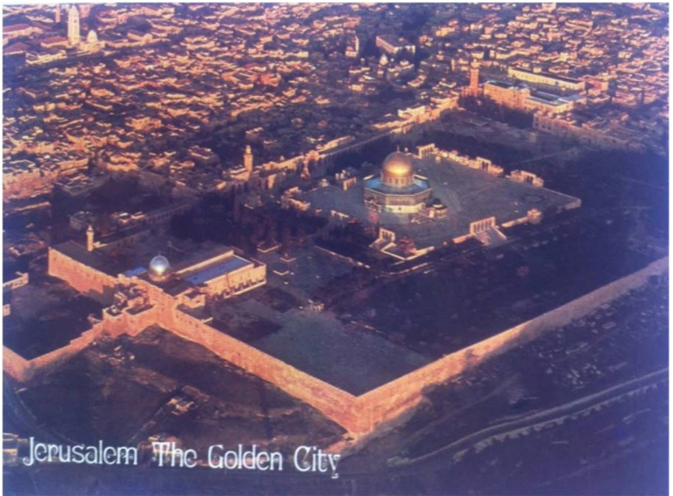
[7] Temple Mount in a tourist postcard from the 1970s