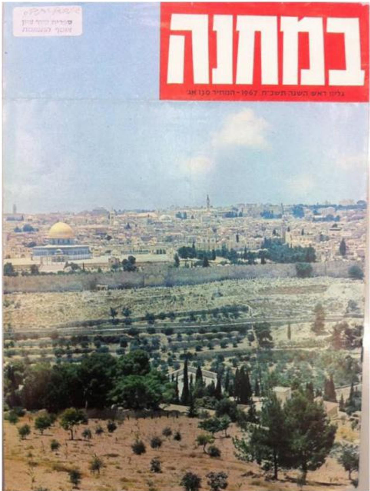
[5]Cover of "Bamahane" weekly, New Year issue 1967. A view of Temple Mount, from Mount Olive.