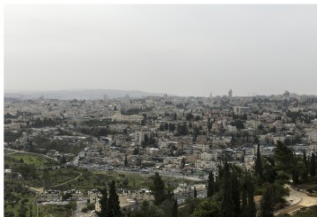
[13]Ariel Hacoheh. Urban Landscape. Digital printing, 212*77 cm. 2015