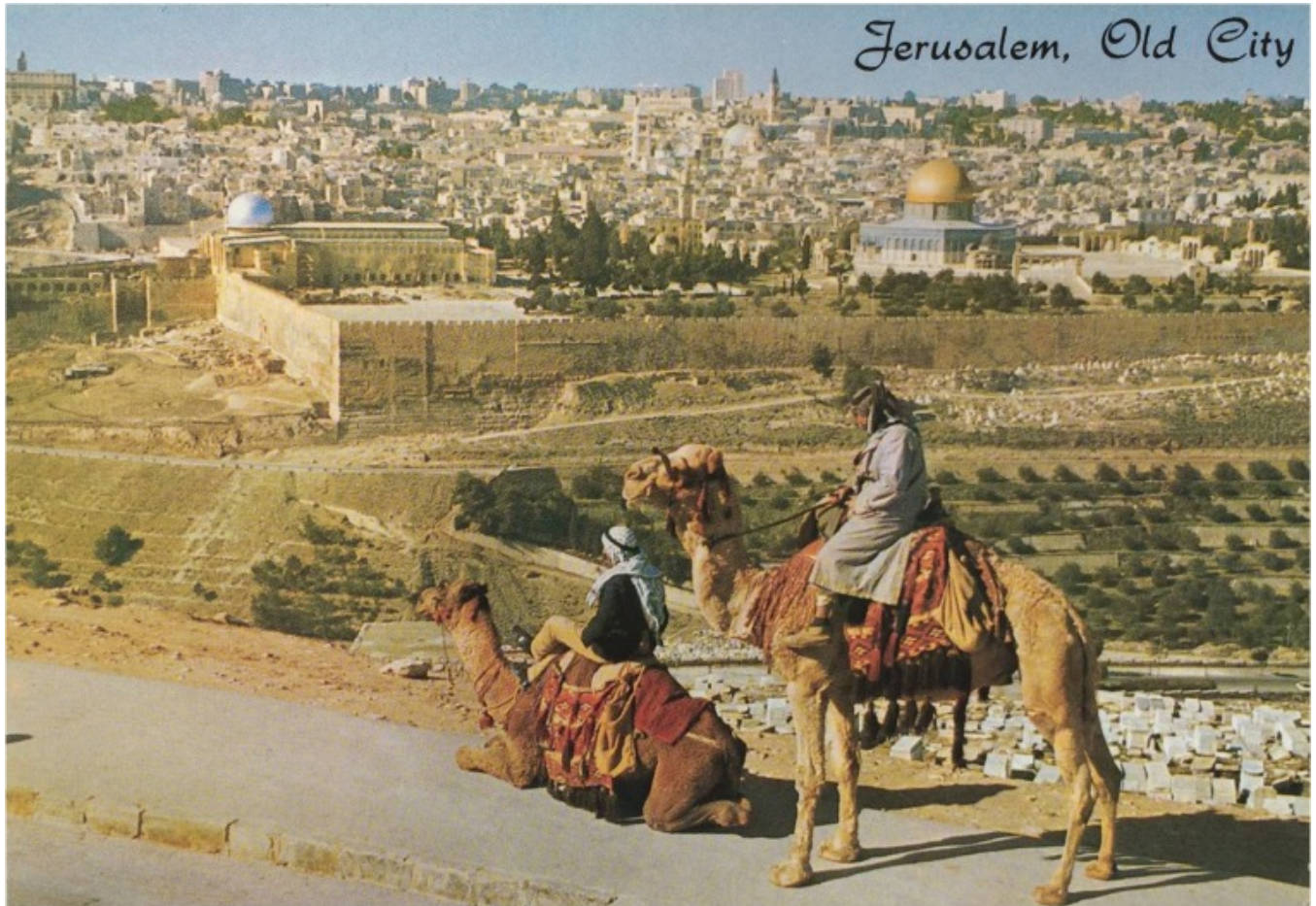
[22] Temple Mount in a tourist postcard from the 1970s

We can consider the differences between the contemporary works in the “Dome of the Rock” exhibition and the historical representations of the Dome in archives by using the distinction between “place” and “space” suggested by the French philosopher Michel de Certeau 4 . According to de Certeau, place represents the order in accord with which elements are distributed. A place excludes the possibility of coexistence of two elements, and it strives for static stability. In relation to place, de Certeau writes, space is like the word when it is spoken, that is, when it is perceived in its vagueness within actual reality and is defined by the changes which arise within the context. Contrary to place, space lacks the stability of the correct, appropriate and proper.