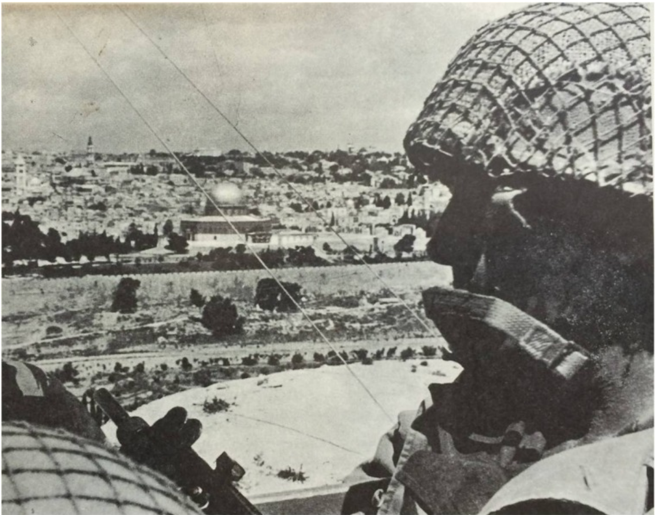
[3]IDF soldiers facing Jerusalem, shortly before breaching the walls and liberating the city 1967. From: The Victorious War Book. Ed. G. Benjamin. Unknown photographer. Ledory Publishing, Tel Aviv

The basic argument of the project is that images of the Dome of the Rock, produced in the past as well as today by state institutions or under their auspices, carry hidden messages and load the photographed site with meaning according to varying political and ideological requirements. That is to say, the photographs of the Dome, prevalent in the Israeli visual field (some of which I will show here), play a consistent, active part not only in describing and representing public mindsets in Israel but also in shaping and setting them.