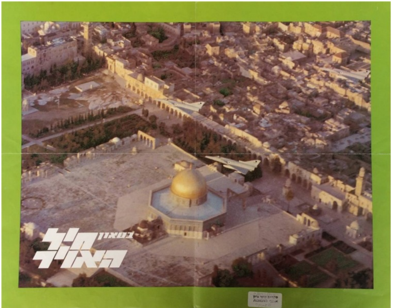
[24]Fighter jets flying over the Dome of the Rock. Poster enclosed in the Air Force's magazine, late 1960s

In times when the status of the Dome of the Rock, as an emblem of Temple Mount, is gaining power in the Israeli and Palestinian discourse as a place of well-grounded, static symbolic meaning, which cannot contain the co-existence of the two nations, the works in the exhibition suggest the place of the Dome, trapped as it is in its tangle of concrete facts, as a new space where unforeseen kinds of relationships are emerging, between looking and control, between representation and reality, and between past and future.