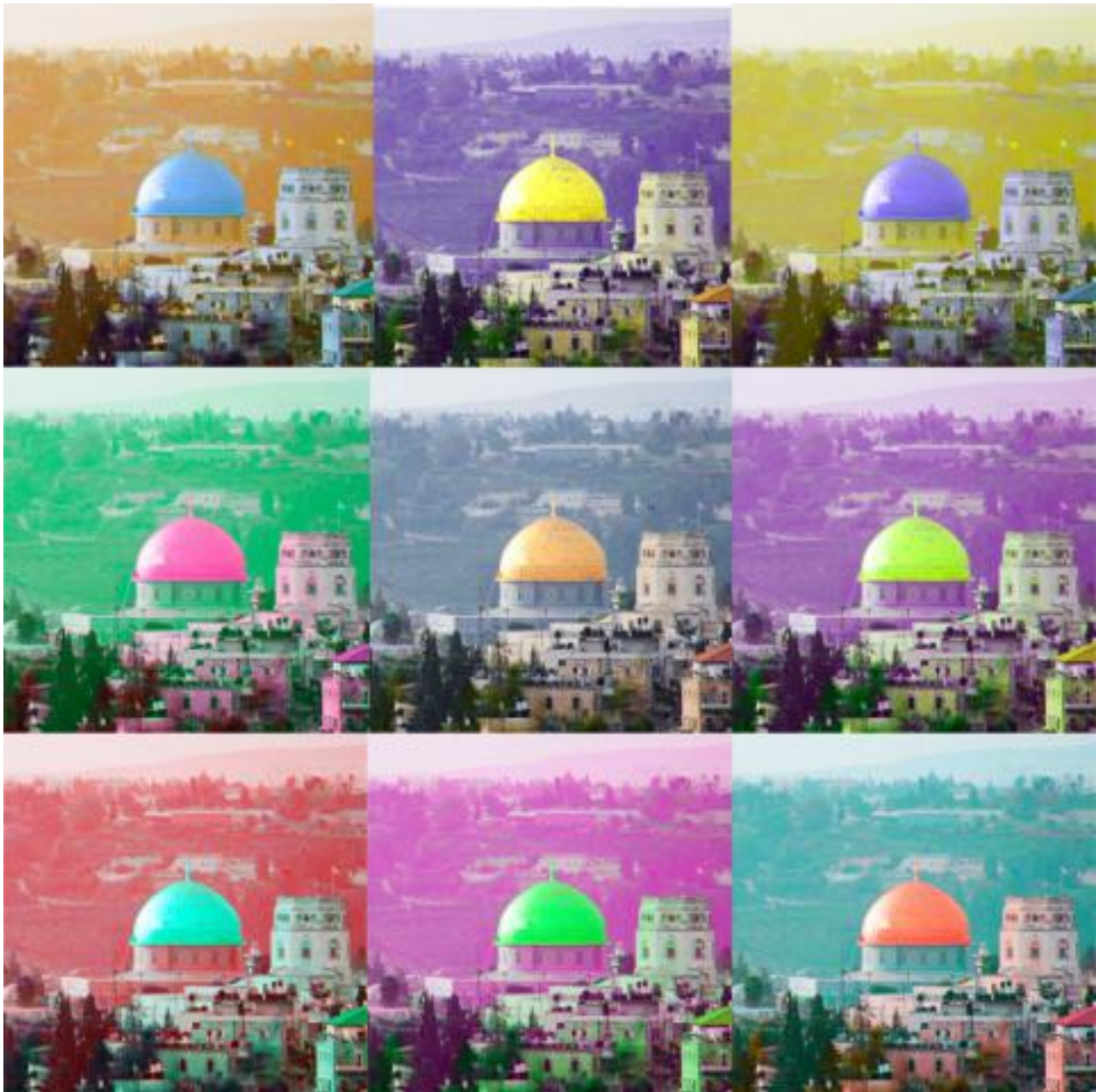
[15]Niv Ben-david, Marilyn Monroe. Digital printing, 60x60 cm. 2015

In the current political situation, when threats of blowing up the mosques are made at least once a year, and when manipulated photographs of the Western Wall sans the Dome are distributed in schools, the elimination of the Dome as a typo or as a bursting balloon, in the works of Hacoen and Adika, may be perceived as more than a mere reflection of the traditional visual manipulations. These works allow us to imagine what the end of the world would look like when the vision of the Apocalypse comes to life.