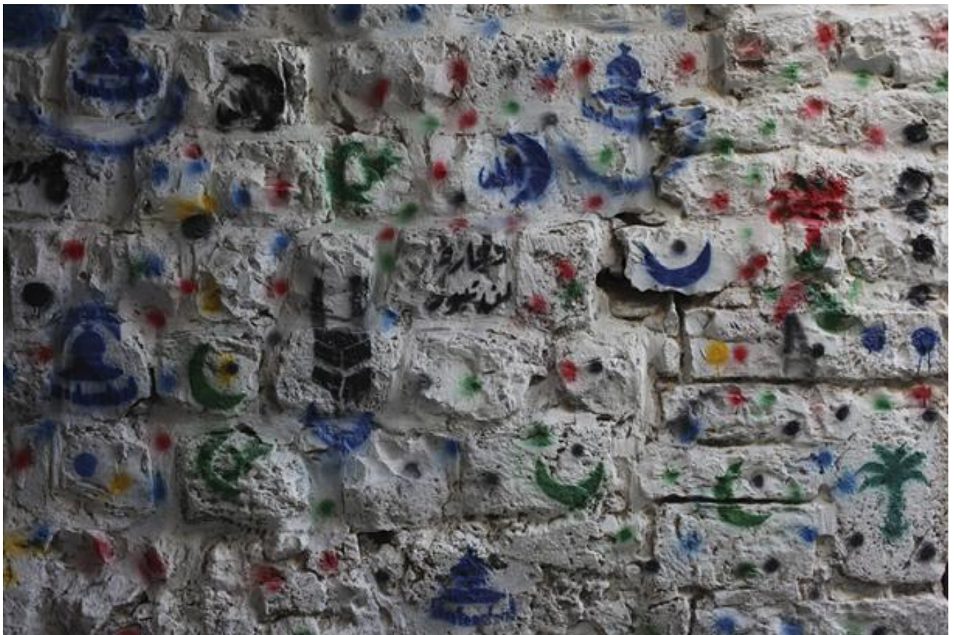
[19]Gaston Zvi Ickowicz. Wall (Old City, Jerusalem) .2015