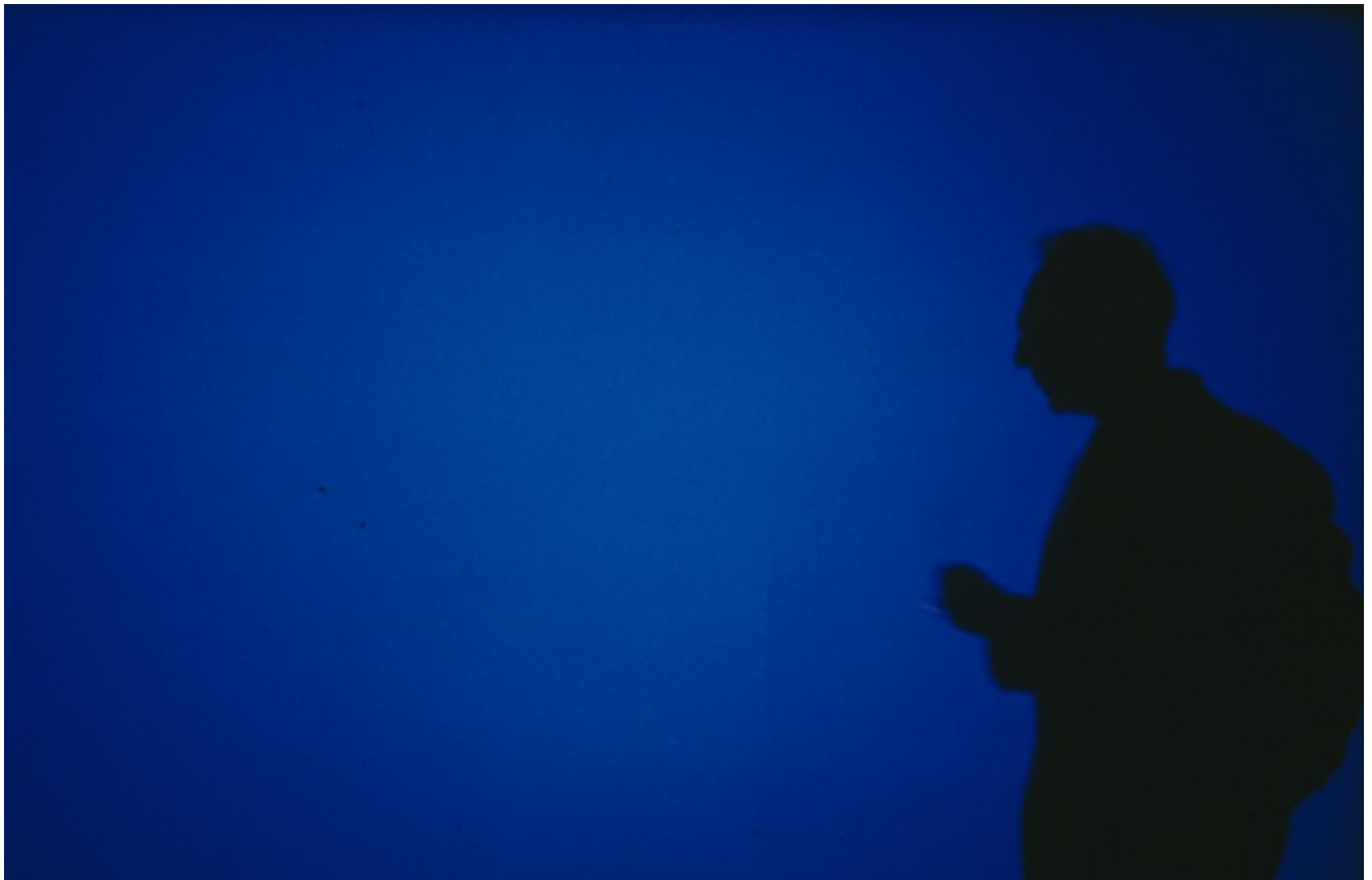
[15]Derek Jarman against the background of BLUE (1993)