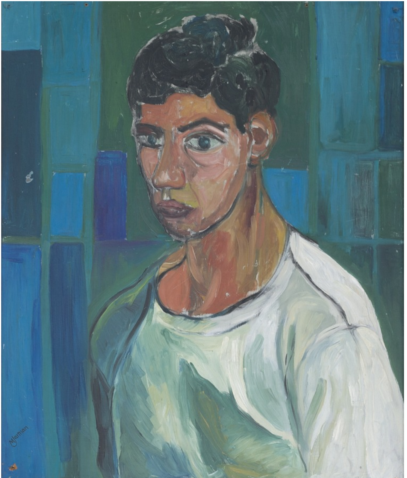
[13]Derek Jarman, Self Portrait, 1959, Oil on board, 65 x 76 cm Private Collection

The exhibition opens with the two opposite bookends of Jarman's work - the first painting and the last film. It was a statement or a curatorial intent that has led me to focus on what was between these two points. The beginning of the exhibition is also its foretold end, then what could I do but