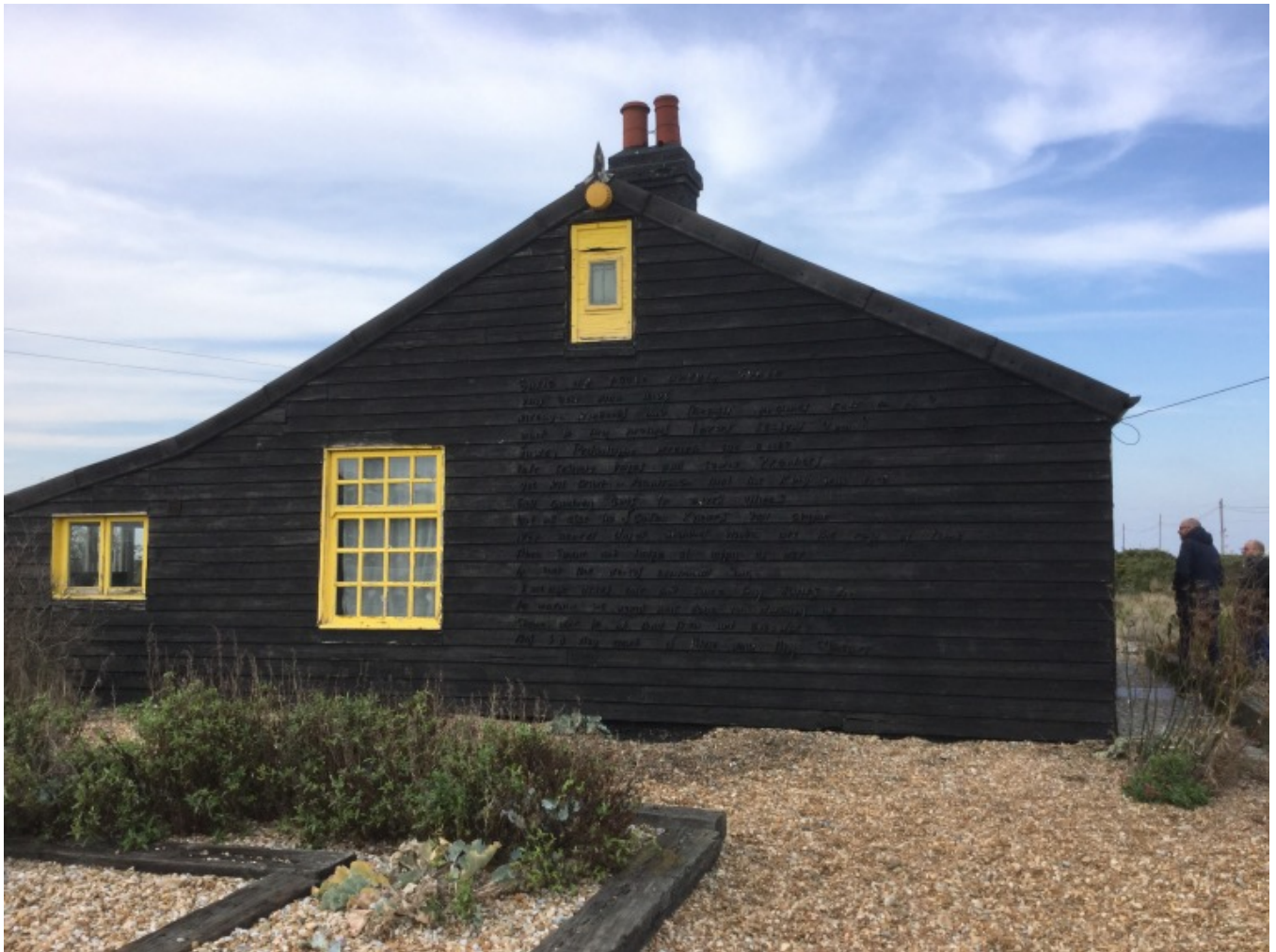
[3]Prospect Cottage, 2016