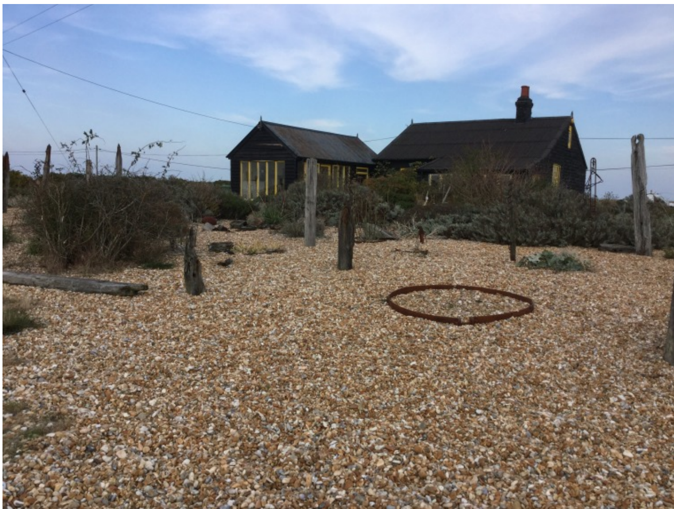
[1]Prospect Cottage, 2016