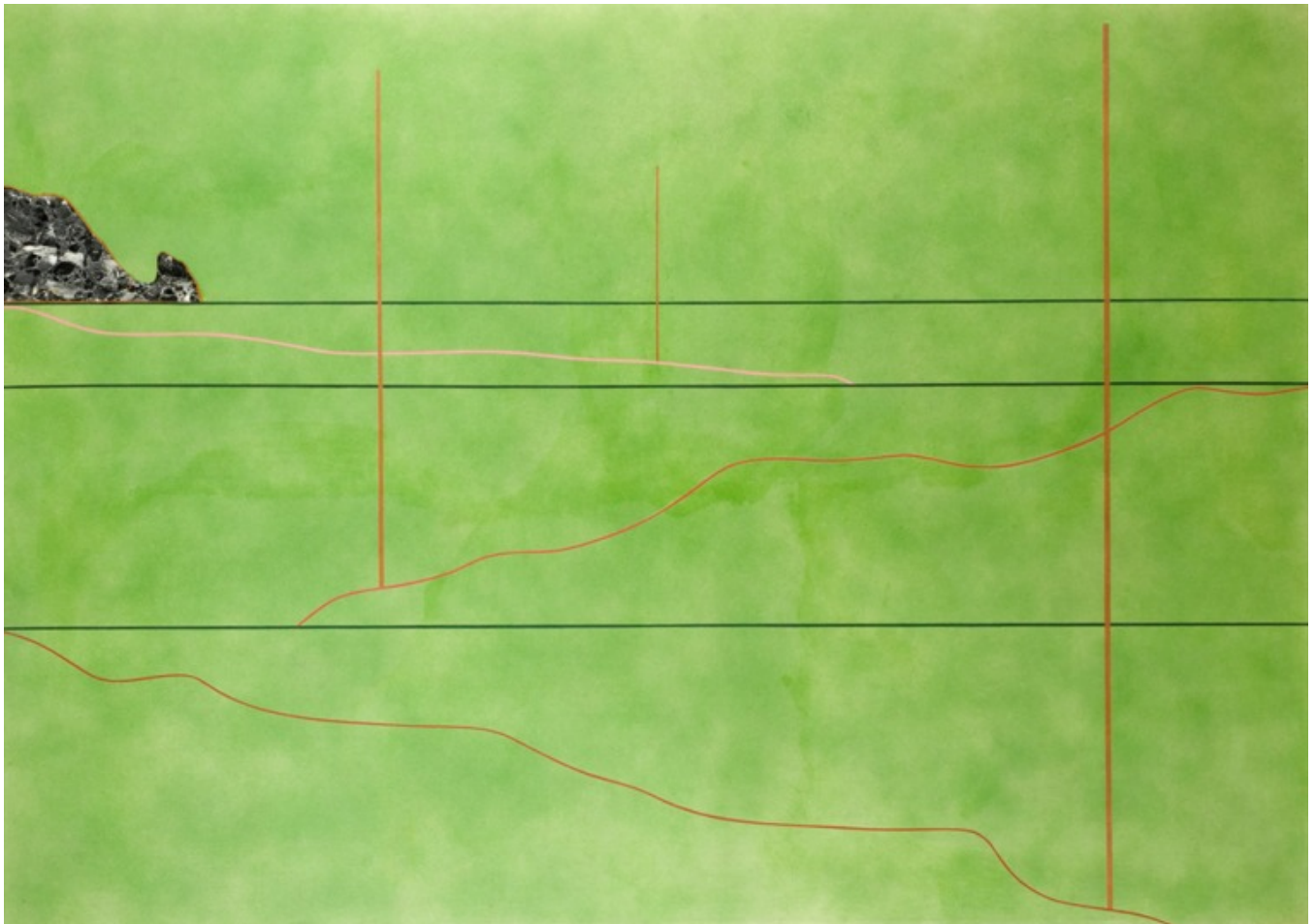
[9]Derek Jarman, Landscape with Marble Mountain, 1967, Acrylic and collage on canvas, 144X206 cm Northampton Museums and Art Gallery

1973, Avebury Series No. 4, oil on canvas 120 x 120cm, Northampton Museums and Art Gallery.jpg [10]