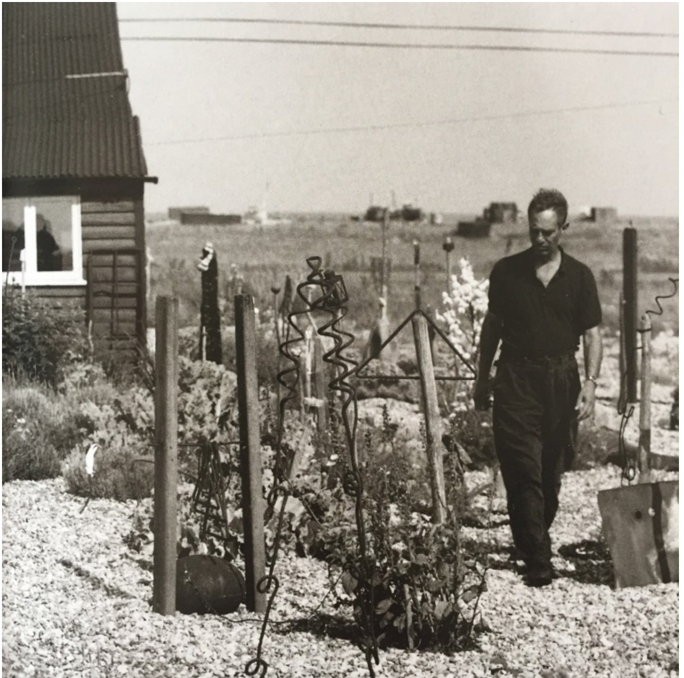
[21]Derek Jarman in the garden at his cottage, in Dungeness