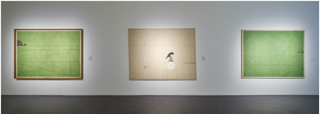
[7]Derek Jarman, Protest! , installation view, Irish Museum of Modern Art (IMMA), 2019

1967, Landscape with Marble Mountain, acrylic and collage on canvas, 144x206cm, Northampton Museums and Art Gallery.jpg [8]