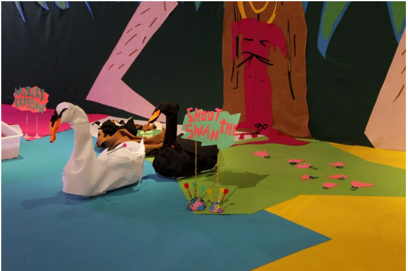
[5]Installation view Slowland. Barbur Gallery, 2017