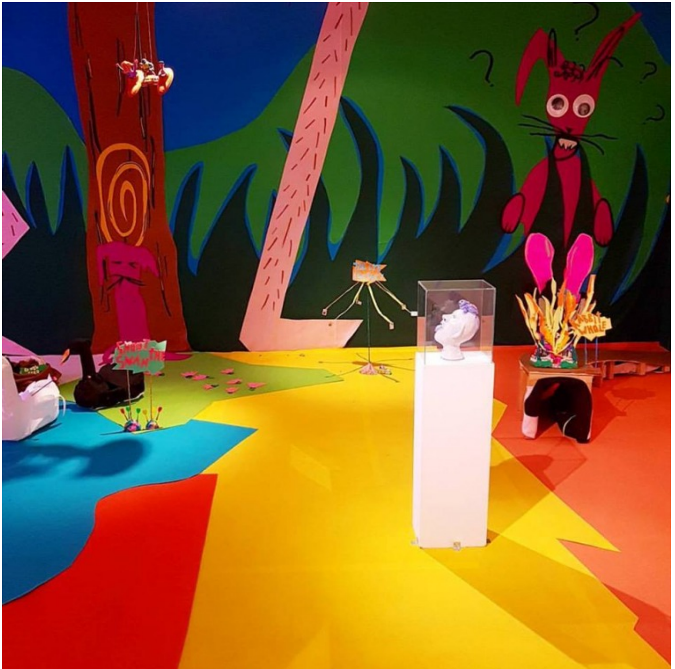
[1]Installation view Slowland. Barbur Gallery, 2017