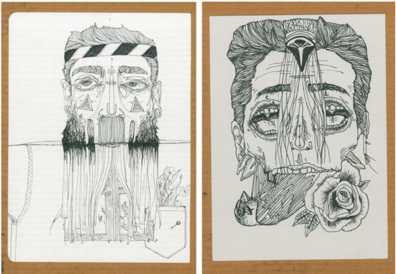
[3]Haitham Charles Haddad. Trip-tych 2014.