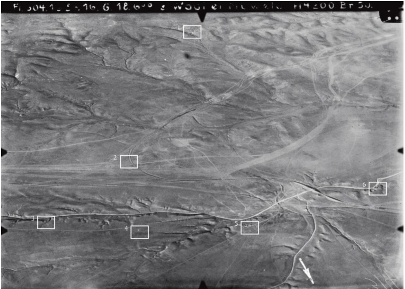
[12]Tall al-Sharia, Bavarian Squadron 304, August 24, 1918

Weizman's visual and contextual turn to geographical, climatic, and geological shifts is therefore read as an attempt to undo the State's main argument against the dislocated inhabitants. While Israel has argued that those lands were not cultivated, Weizman, through the work of different members of Forensic Architecture, traces testimonies and visual evidence that clearly suggest that these lands have been cultivated for centuries. "It's an area where, allegedly, agriculture cannot exist, and therefore there are no permanent settlements and no one can claim ownership," Weizman told Shai Zamir, in an interview published recently in Yediot Ahronot [13] (Hebrew), "therefore the desert belongs to the State, which can deposit its junk there – nuclear reactors, refugees, prisoners, polluting factories. [...] It's a well-oiled machine of courts and police and administration, all working together to eject people who have lived on their land for centuries, and dispose of them in towns that offer no jobs and function like refugee camps. The Bedouin Nakba is happening now. It is not a historical process that has ended and requires commemoration days. 1948 is happening now and people need to get down there and protect these people."