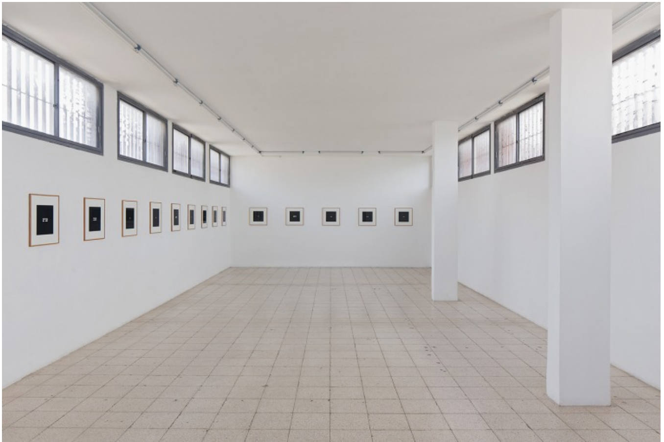
[7]Yossi Breger. A Guide for the Perplexed: Homonyms. Installation view 2016 Dvir Gallery.

Among other things, Breger has borrowed from Beckett the use of gaps and the manipulation of the inclination to complete patterns, in a way that reveals a more abstract, more essential structure while undercutting and questioning it. Beckett's indication is similar to the economy and the elimination of adjectives in the show, which seeks to rid the language of everything but its main abstract essence.