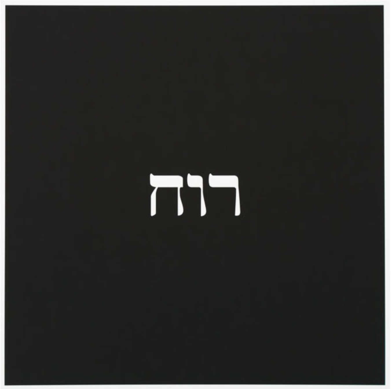
[1]Yossi Breger, Word #40. Ink print on archival paper, 52x52x2 cm 2016.

Maimonides's "abstract whole" describes a way of knowing God by the subject. According to him, knowledge of God is abstract, and cannot be conceptualized through words. He, therefore, sought to clear the everyday language of superfluous concepts that might be misleading regarding the divinity. Instead, he recommended trying to achieve comprehension of the divinity as an abstract whole through the homonyms. The show's title, "a Guide to the Perplexed: Homonyms," places the words in an abstract construction, with no conjunctions or adjectives to turn them into a sentence. This construction obliges us to fill the gaps between the words with their secondary meanings – their connotations – everything the words convey beyond their basic meaning (their denotation).