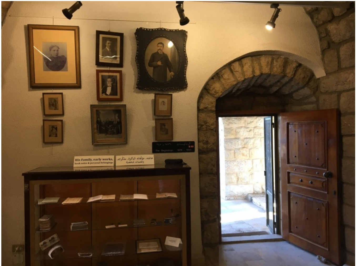
[1]The Ameen Rihani Museum interior, displaying Rihani's manuscripts, art, and effects