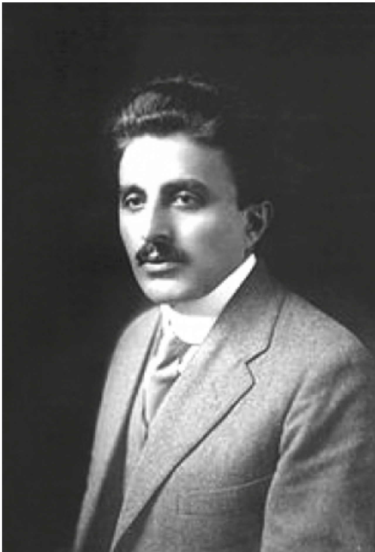
[13]Ameen Rihani, 1916