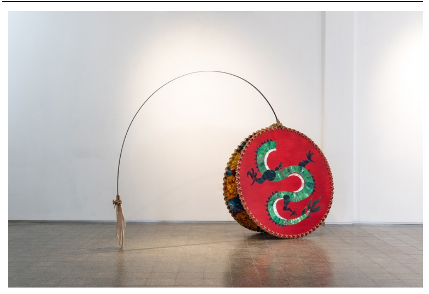
[3] Daniel Oksenberg, Cherry Bomb, 2020, oil paint, jute rope, metal, wood, 175X250X70 From: Sweaty Grips (curator: Sagie Azolay), Maya Gallery, Tel Aviv

In The Juggler , the bare plywood hands are positioned like supports on both sides of a wooden stand holding disks with holes in their centers: they are like nuts used in building and construction to hold the bolt while it is inserted into a piece of wood, to avoid trauma to the wood and to keep the parts of the structure well tightened. The plywood nuts are large, painted in oil and industrial paints, and tied together with rope, like juggler's balls frozen in mid-air. The ropes are prominent, same as in Cherry Bomb , drawing attention as the dominant, weighty materials of the structure in two ways: as limbs holding the nuts in place – the nuts' meaning and function are not clear – and also in their visual role as the organizers of the composition. Here Oksenberg used painting to point to the element of air: runs and stains spread over the painted surfaces and blended as if a blast of air had flattened and scrambled them. Or perhaps the fluid paints have run together after the disks were hung facing different ways in the open air – the very same air that captured the flying balls.