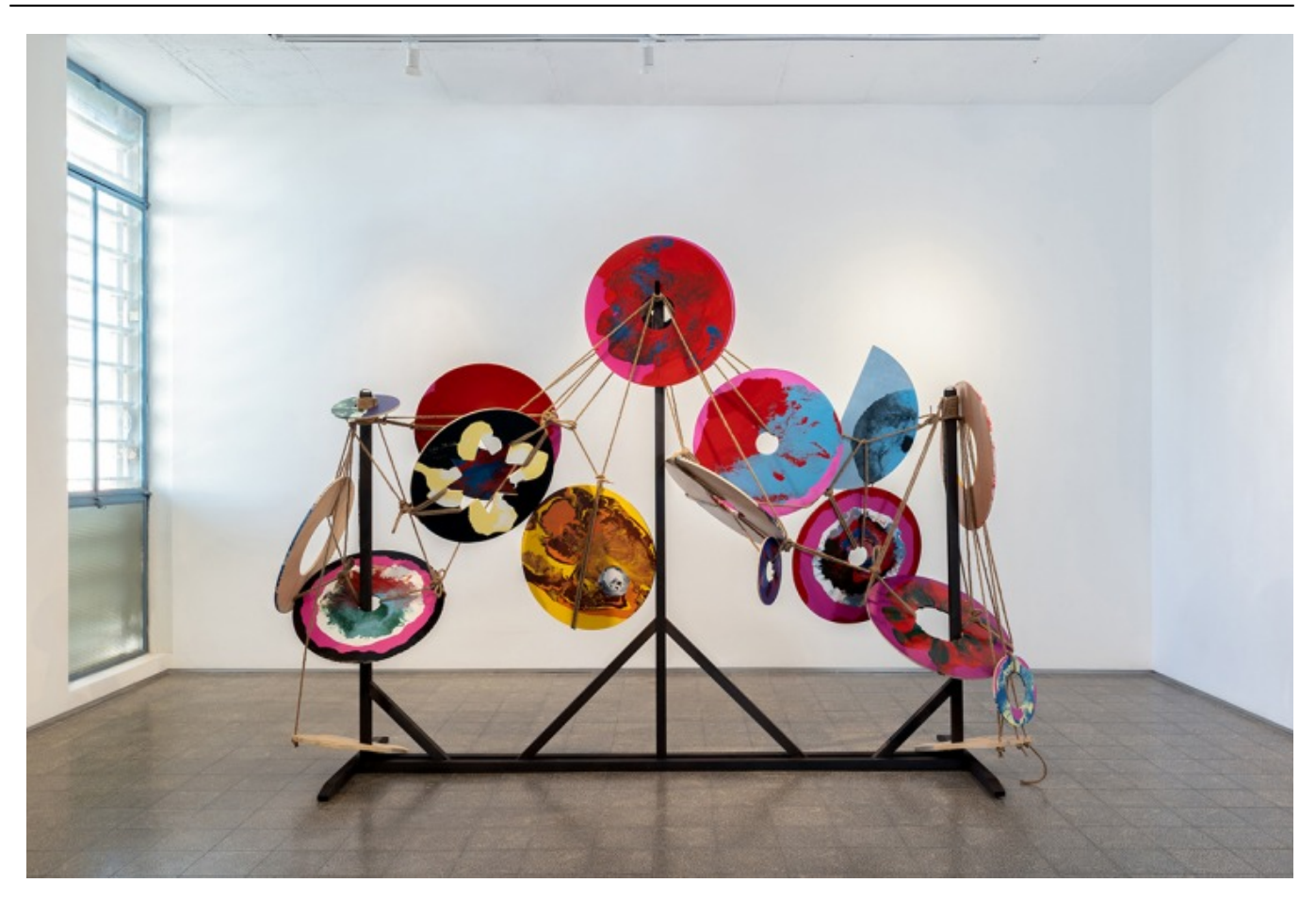
[5] Daniel Oksenberg, The Juggler, 2020, oil paint, jute rope, metal, wood, 200X240X85 From: Sweaty Grips (curator: Sagie Azolay), Maya Gallery, Tel Aviv

Like The Gambler , in Ocean Winks , the nut-like plywood disks are spread on the floor, connecting nothing. They were set among ropes attached to a papier-mâché rock. The rock seemed to have a lighter mass and highlighted the heaviness of the ropes and the disks. The latter resemble buoys or lifeline floats because of their uniform colors: light blue, orange, dark blue, black, and white. The whole structure is reminiscent of the remains of a ruined ship caught around a rock on the beach. The nuts, which generally function as aids to connections, objects that mitigate weight-bearing tension, were strewn all around like the ropes. This alludes to a fact mentioned in the exhibition text: the ropes in the works are knotted and interwoven in a technique inspired by Shibari – a Japanese tying-up practice mostly used in the context of BDSM.