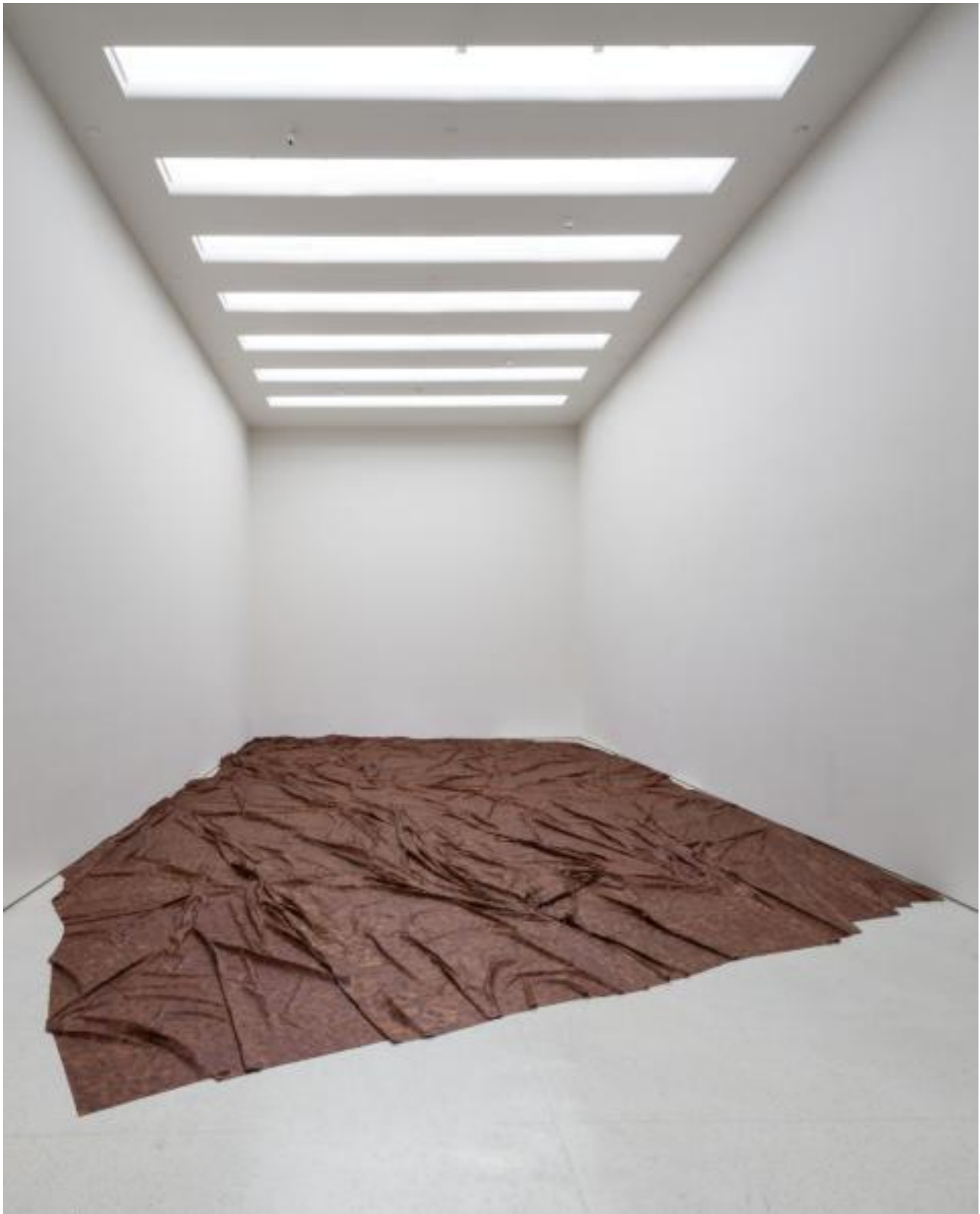
[1]Doris Salcedo, A flor de Piel Installation

view: Doris Salcedo, Solomon R. Guggenheim Museum, New York. June 26th – October 12th, 2015.