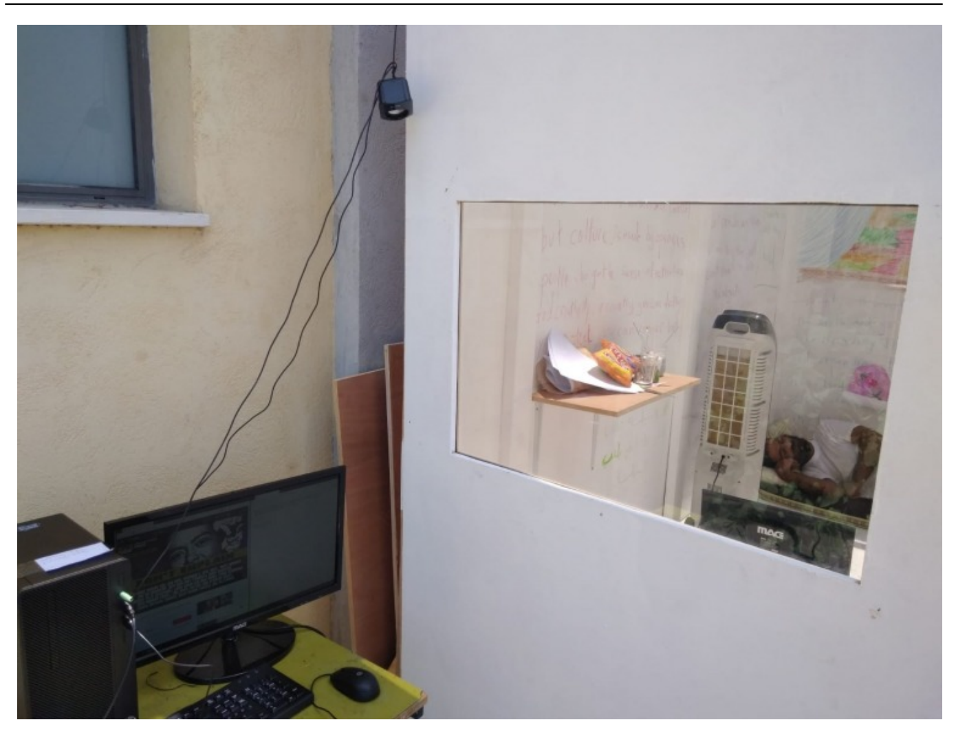
[9]Rabia Salfiti, That Man in That Box, 2018