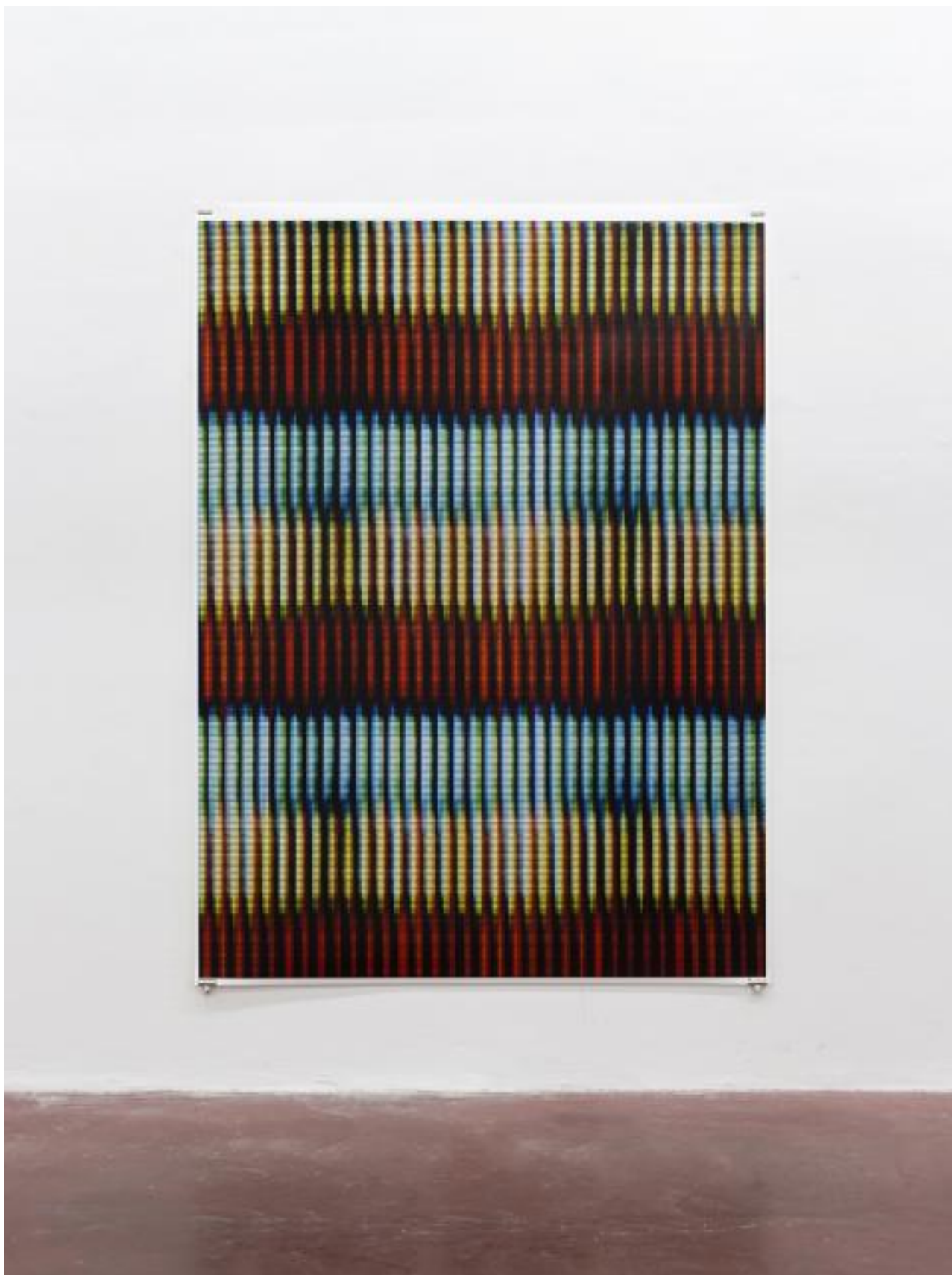
[9]Matan Mittwoch, Blinds (XI)

2015, archival inkjet on rag paper, 160x213.5 cm. Courtesy of Dvir Gallery and the artist. Photo: Elad Sarig