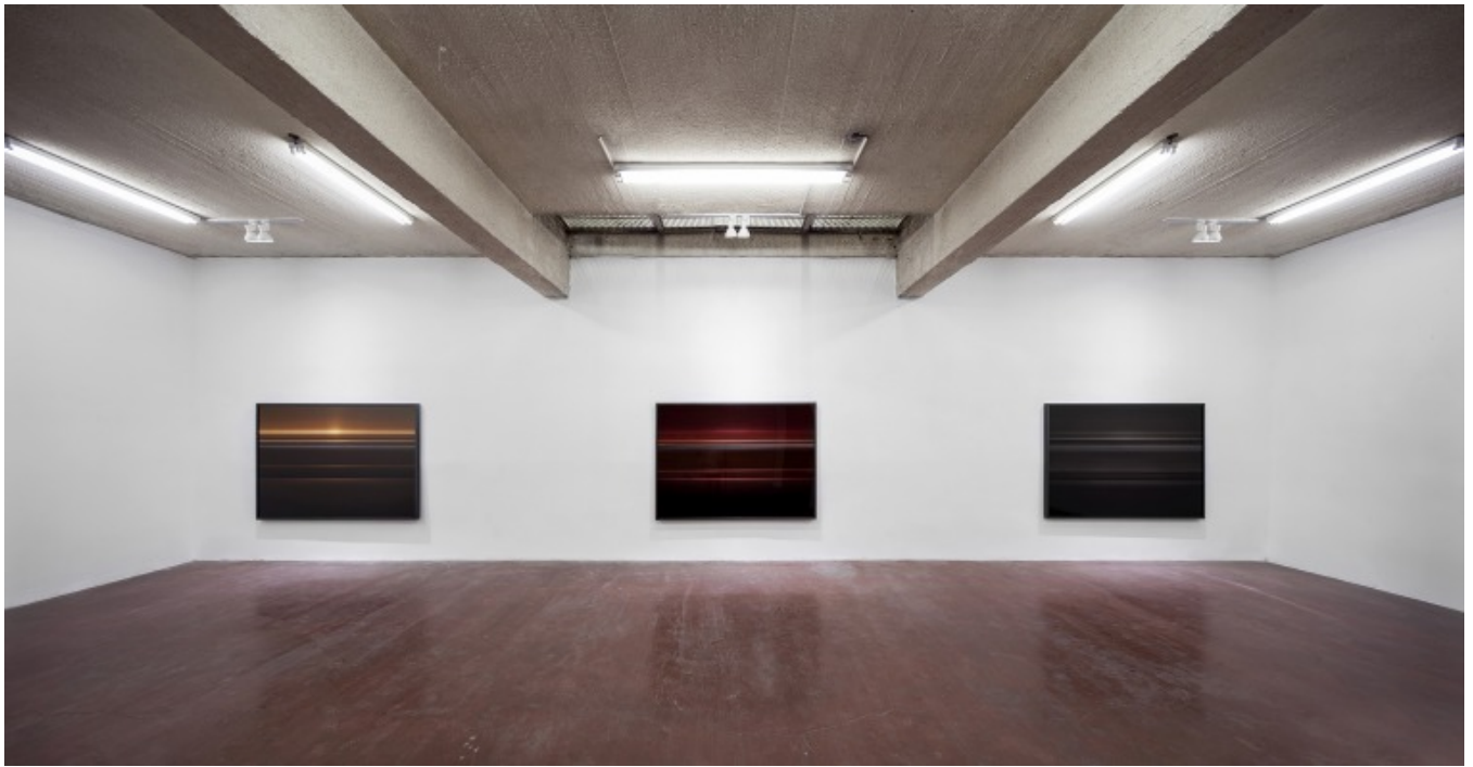
[3]Matan Mittwoch, Waves (I-III)

2013-14, archive pigment print, 142.1x196.3cm (each).