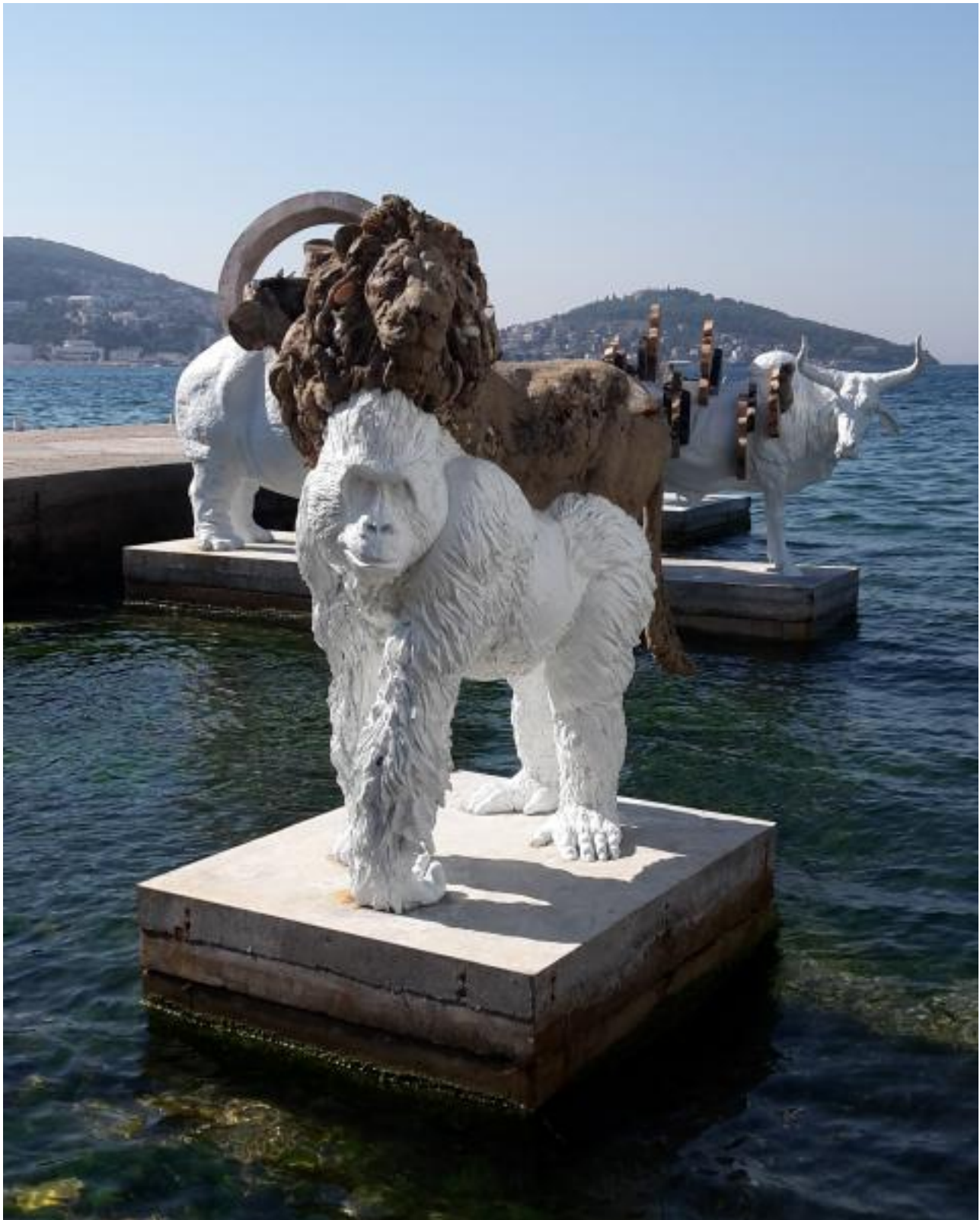
[7]Adrián Villar-Rojas, The Most Beautiful of All Mothers 2015

Finally, Noah's ark anchors at the museum. At Istanbul Modern, the museum of modern art, Christov-Bakargiev has curated a group show that embraces contemporary artists as well as figures from the 19th and 20th centuries. The exhibition presents new and old works, next to works newly reproduced