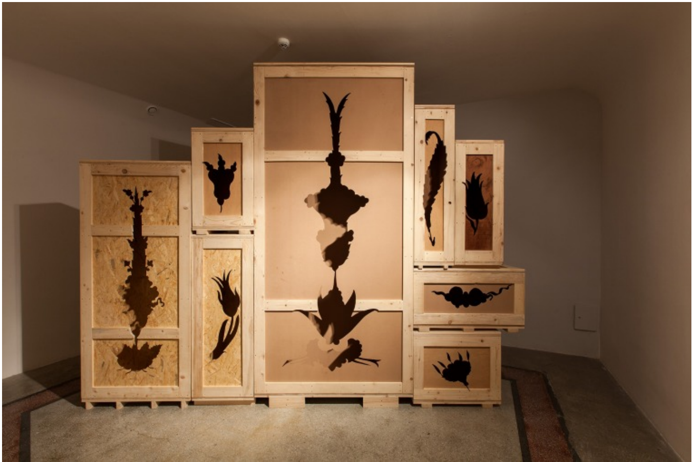
[1]Walid Raad, Another letter to the reader 2015