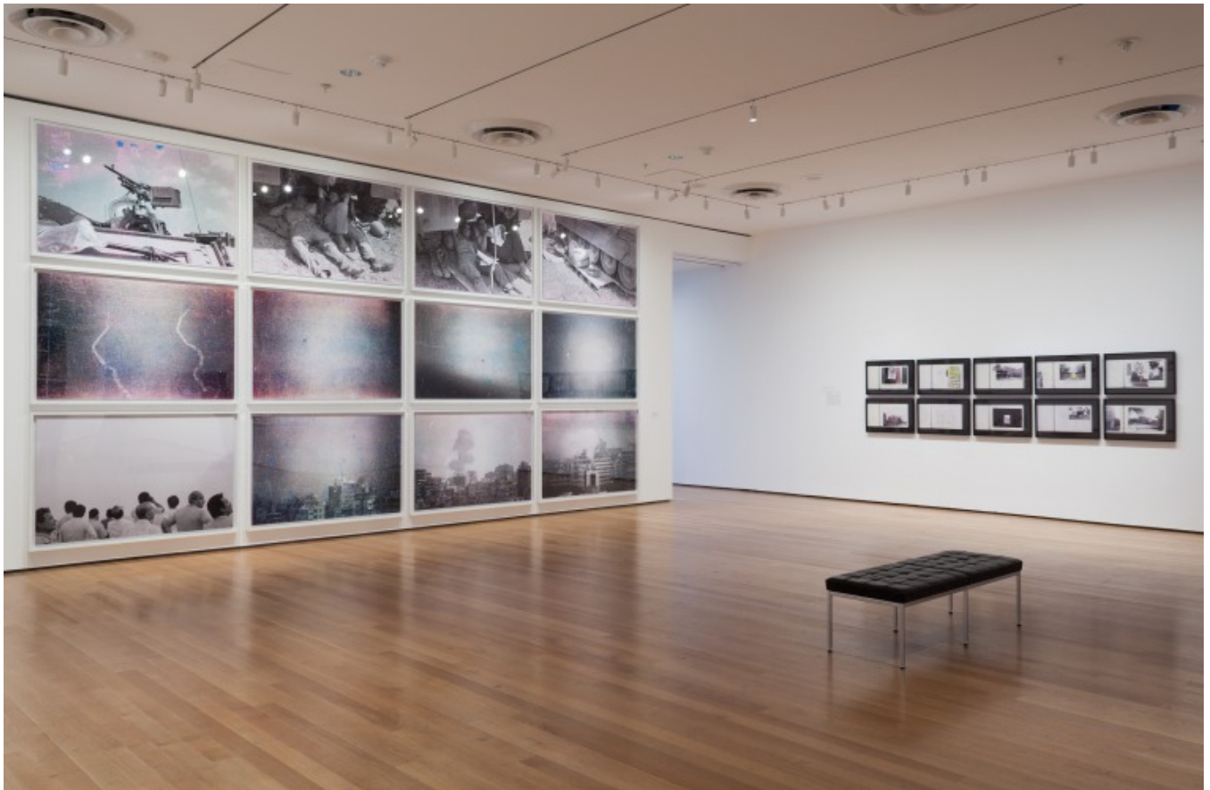
[3] Installation view of Walid Raad, The Museum of Modern Art , 2016

The exhibition, situated on two of the museum floors, is divided into two main projects: works created by The Atlas Group are located on the third floor, and the ongoing project “Scratching on Things I Could Disavow” is located on the second floor.