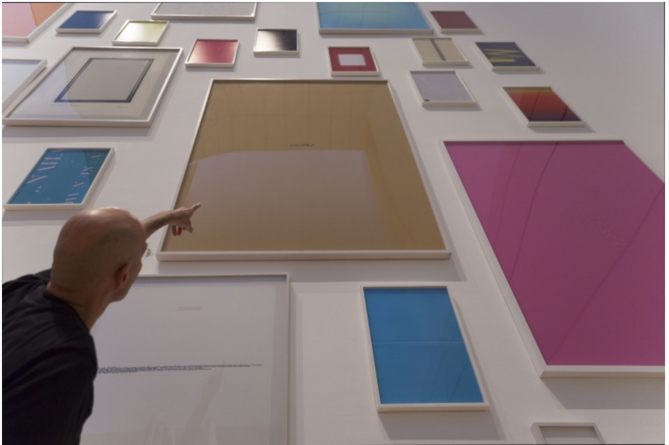
[11]Walid Raad. Scratching on things I could disavow: Walkthrough

2015. Part of Walid Raad, The Museum of Modern Art, October 12, 2015-January 31, 2016 © 2015 The Museum of Modern Art, New York. Photo: Julieta Cervantes