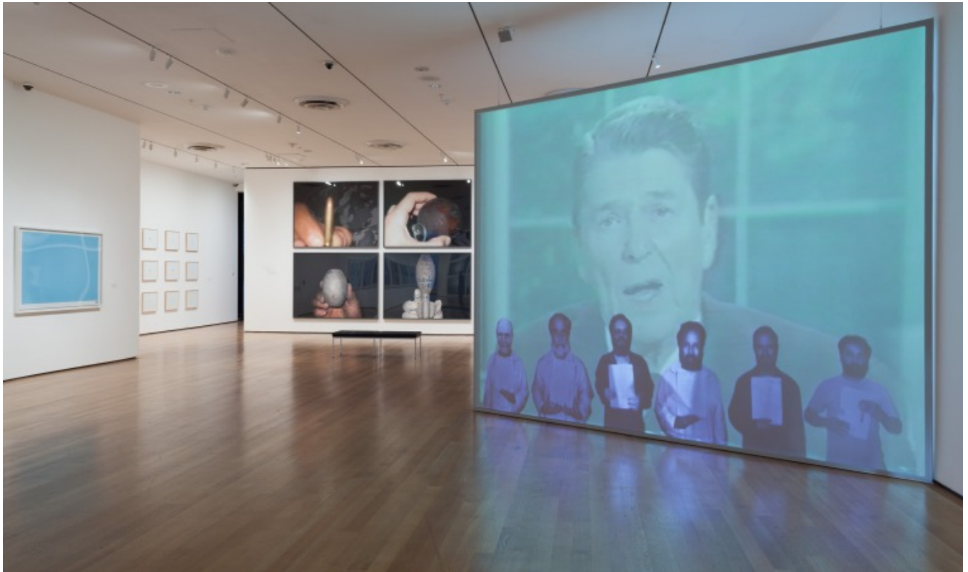
[7]Installation view of Walid Raad, The Museum of Modern Art