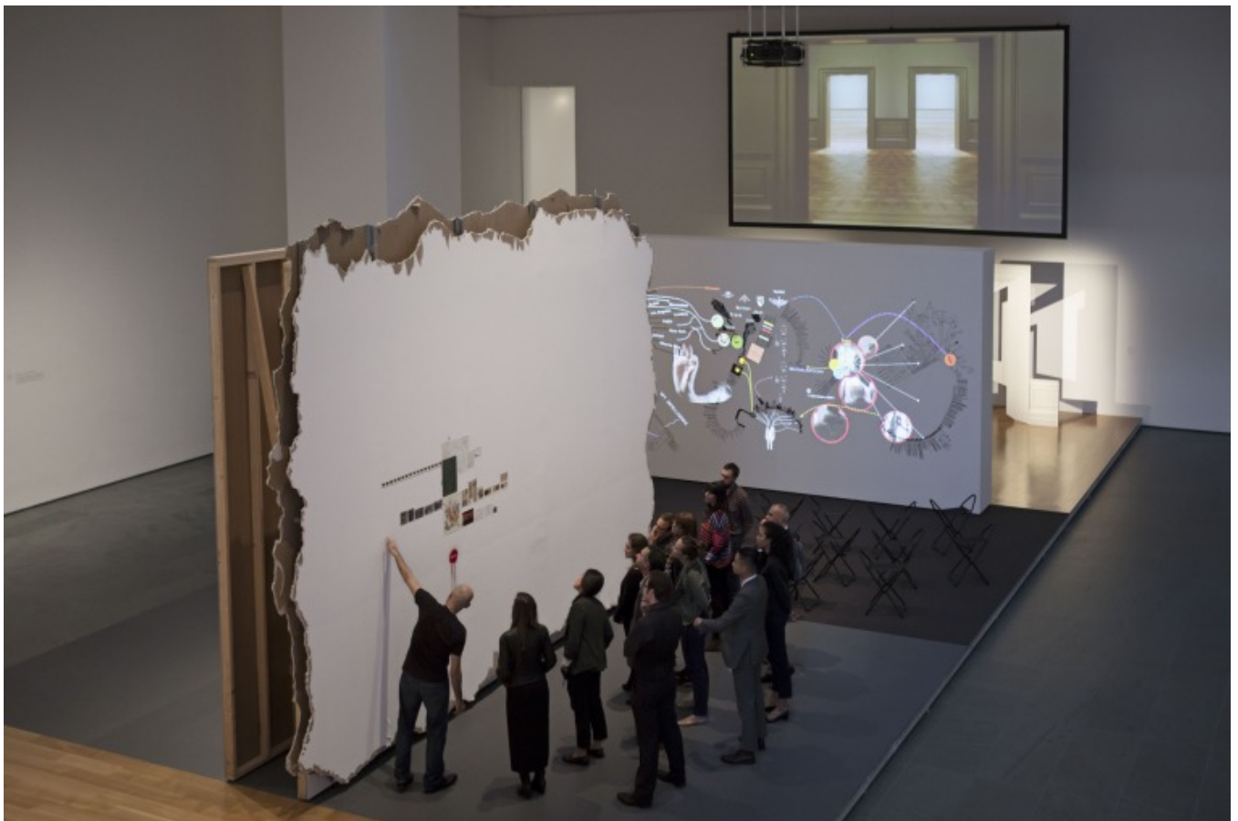
[9]Walid Raad. Scratching on things I could disavow: Walkthrough

2015. Part of Walid Raad, The Museum of Modern Art , October 12, 2015-January 31, 2016. © 2015 The Museum of Modern Art, New York. Photo: Julieta Cervantes