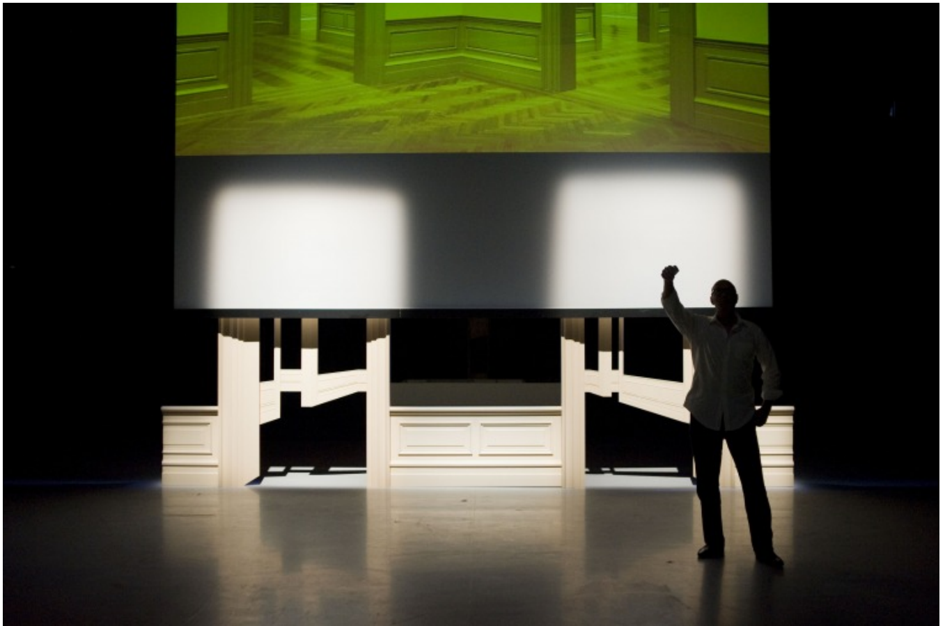
[13]Walid Raad. Scratching on things I could disavow: Walkthrough

2011. Performance, Kustenfestivaldesarts, Les Halles de Schaerbeek, Brussels, 2011.