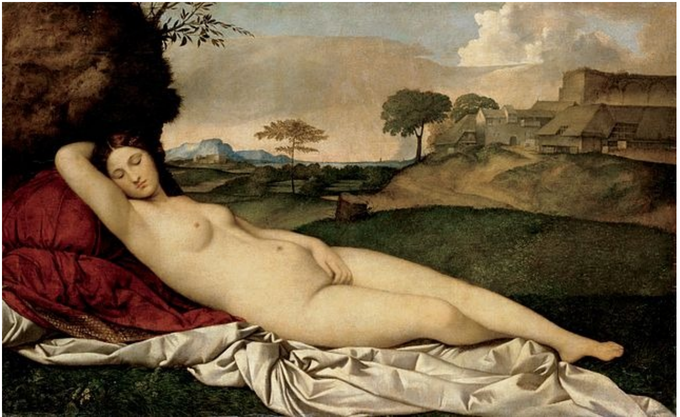
[6]Giorgione, The Sleeping Venus, oil on canvas, 108.5*175 cm. Gemaldegalerie Alte Meister, Dresden, circa 1510