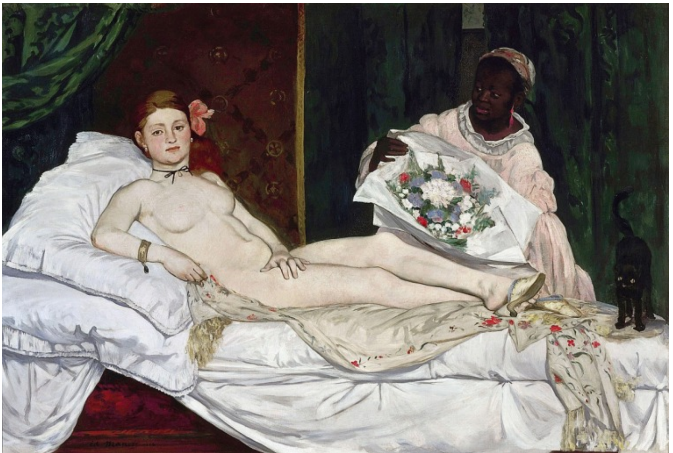
[9]Edward Manet, Olympia, oil on canvas, 130.5*190 cm. Musee d'Orsay, Paris, 1863