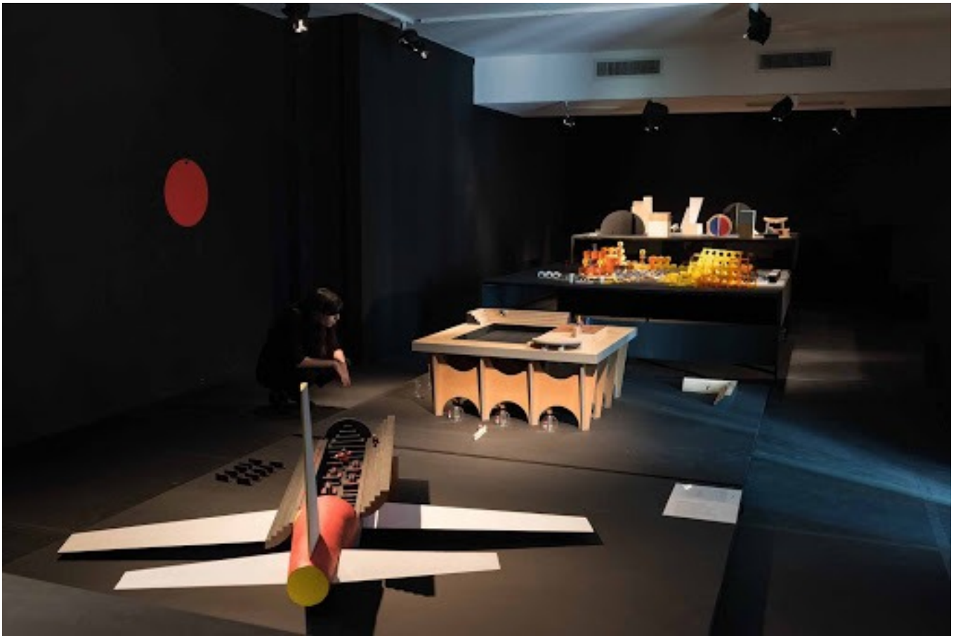
[3]Ohad Meromi, Resort, general view, CCA Tel Aviv, 2015

Sunbather__print+(1+of+5)1500x1000.jpg [4]