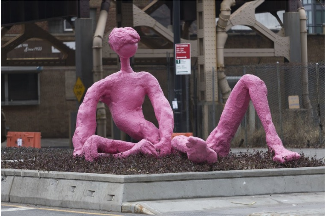
[5]Ohad Meromi, Sunbather, 2016, cast bronze & auto body paint, Long Island City, N.Y.

border-crossing-installation-view-c-booths-1500x1227.jpg [6]