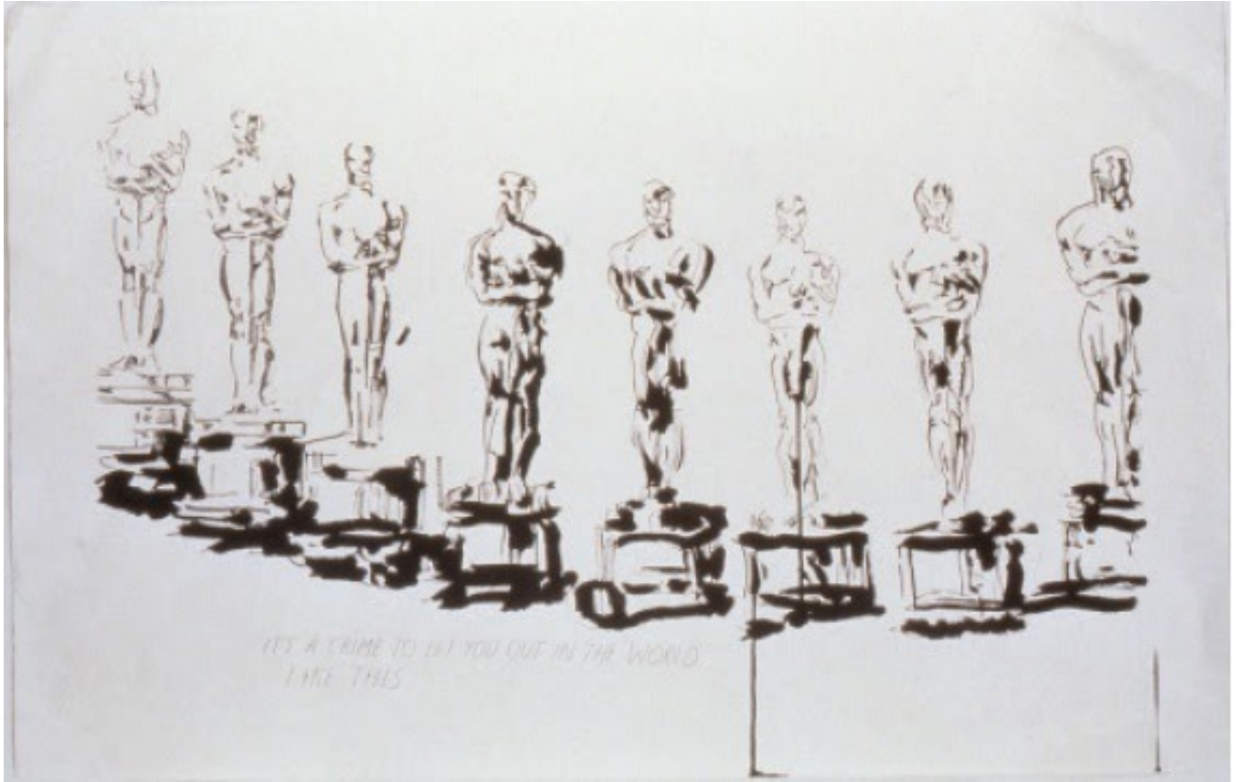
[3]Raymond Pettibon, No Title (It's a crime...), ca. 2000 Pen and ink on paper, 64.5x101 Collection of Sam and Shanit Schwartz, courtesy of Regen Projects, Los Angeles