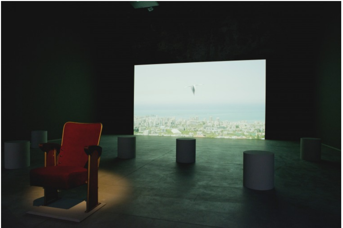
[14]Akram Zaatari. Letter to a Refusing Pilot, 2013

Installation view, Lebanese Pavilion, 55th International Venice Biennale.