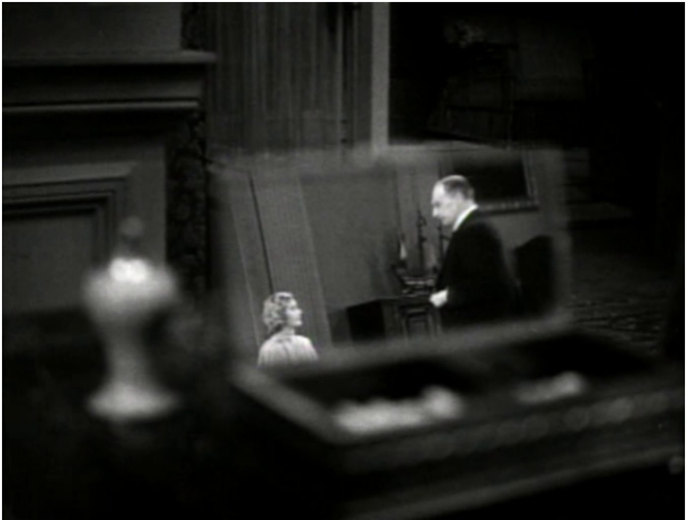
[9]Vampire and Mirror from Dracula (1931) dir. Tod Browning