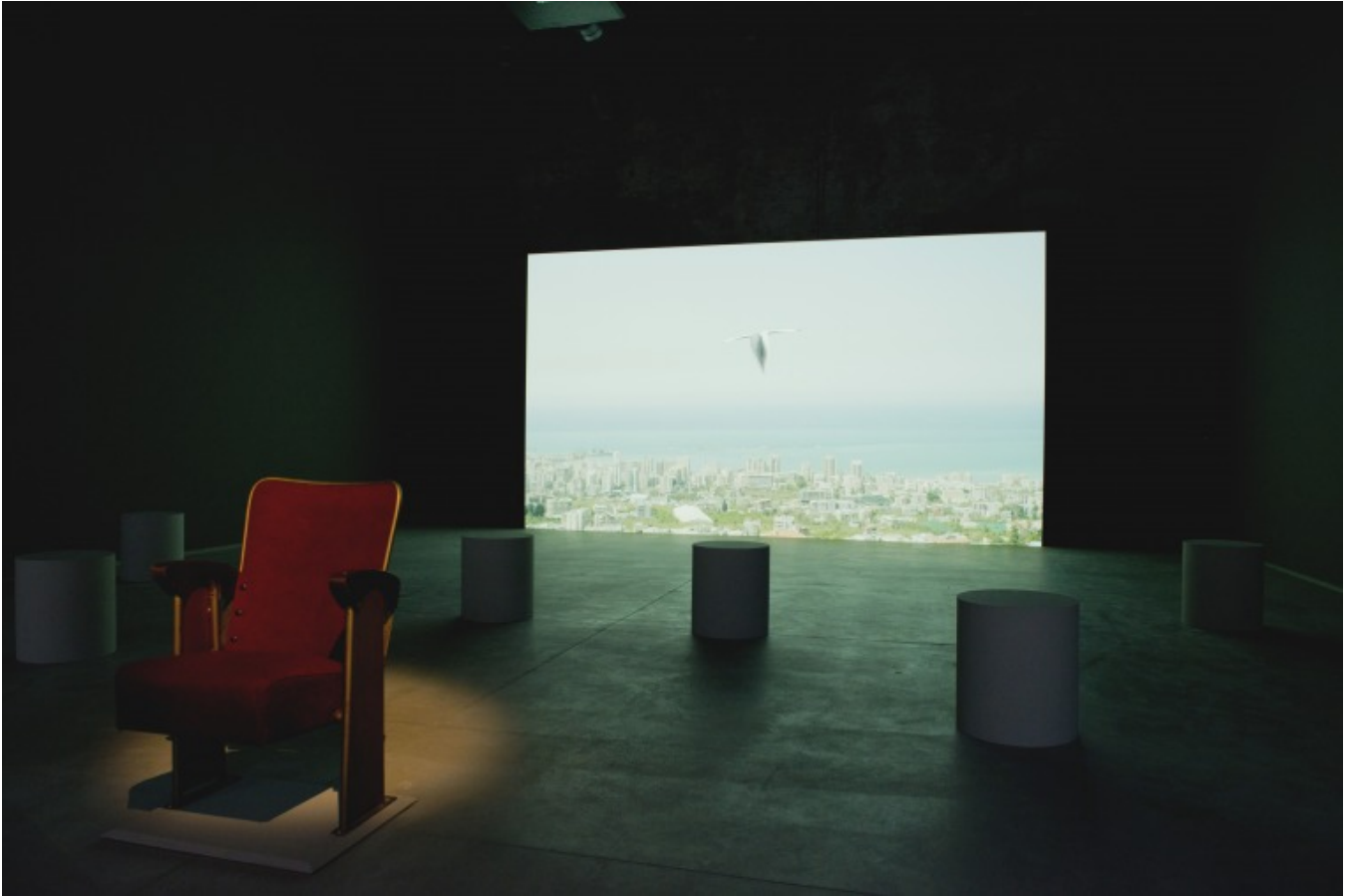
[14]Akram Zaatari. Letter to a Refusing Pilot, 2013 Installation view, Lebanese Pavilion, 55th International Venice Biennale.

Zaatari's conversation with Avi Mograbi had different formal characteristics. First, it was performative, given the fact that the conversation discussed here is the one that occurred in Aubervilliers. Secondly, their relationship began from a mutual recognition as filmmakers in a third space, a film festival in Italy, neither Israeli nor Lebanese. 18 In addition to this, they use photographs in the way that Ariella Azoulay describes as discursive democracy, using a civil contract of photography. They use the photographic trace as evidence of the intersection between their personal and political lives and as a space for interpretation and counter-interpretation. Finally, Zaatari and Mograbi were able to acknowledge to one another the power dynamics that exist when an Israeli and a Lebanese artist work together. The Other Side of Shebaa Farms is a perfect example of this. It isn't about collaboration that illustrates some kind of utopian coexistence. Instead they are in dialogue, collaborating on a project that ultimately reveals the fact that their dialogue is constantly cut off by the borders, checkpoints, closed military zones, and other territorial limits. But in my view, it was important that they were engaged in this conversation, one that was honest about its limits and revealed its impossibility but worth attempting nevertheless.