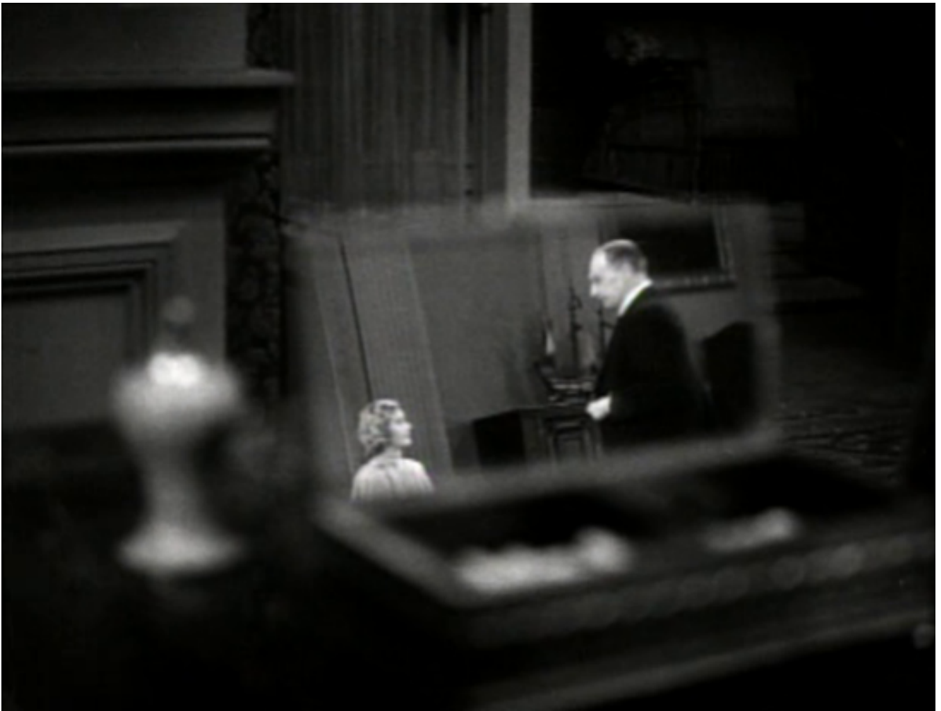
[9]Vampire and Mirror from Dracula (1931) dir. Tod Browning