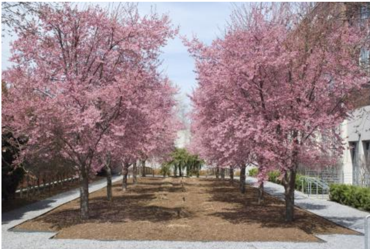
[8]Exterior view (West Garden), Dia:Beacon, Riggio Galleries, Beacon, New York.

מראה חוץ (גן מערבי), דיה:ביקון, גלריות ריג'ו, ביקון, ניו יורק.