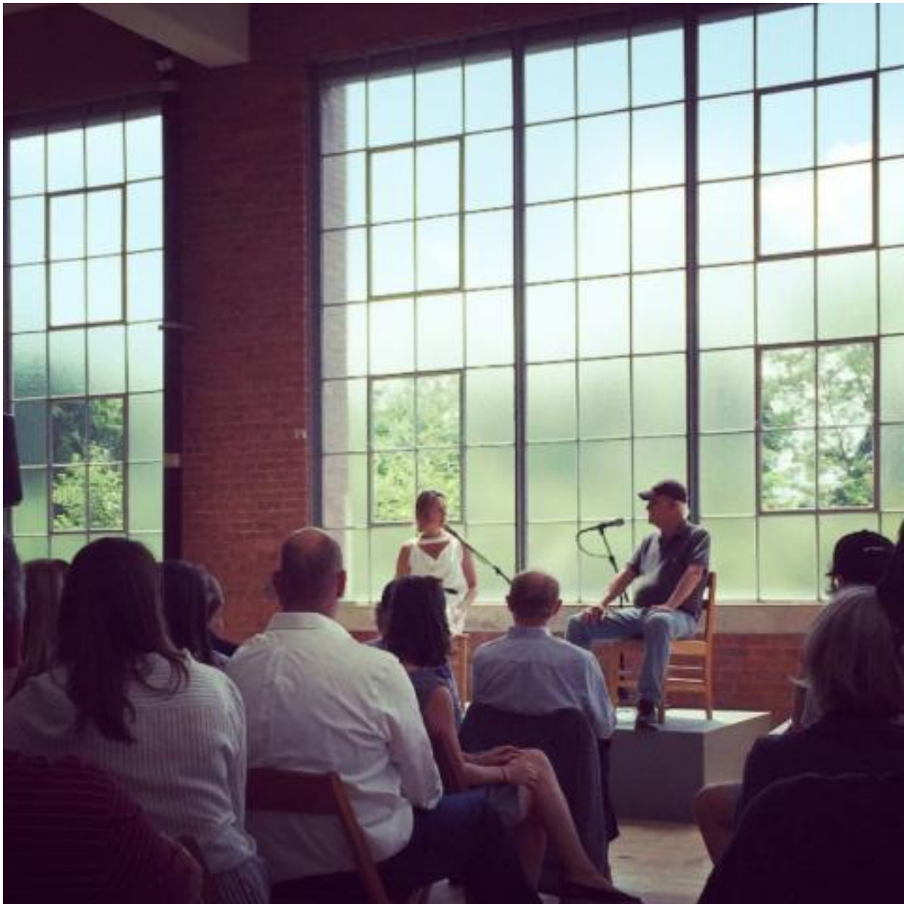
[1]Talk at the Dia

Established in 1974, The Dia Foundation set out to help artists realize projects that could not fit within the confines of traditional museums. Working with artists such as Donald Judd, Dan Flavin and Richard Serra, the foundation was involved in many projects that came to define land art, minimalism and other artistic experiments with viewership and space. At the beginning of the new millennium, it became clear they needed an exhibition space outside of their Chelsea location to present their collection, one that will be designated for a prolonged dwelling with the artworks.