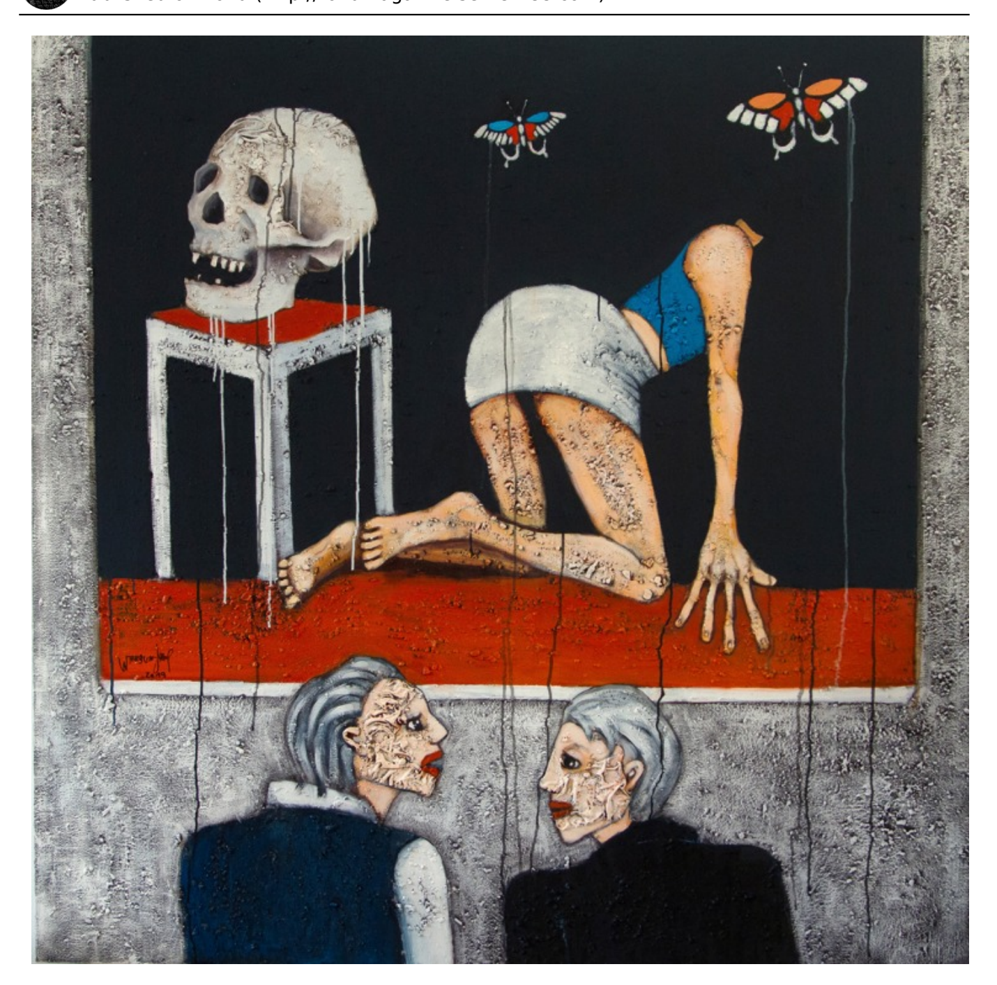
[5] Youssef Wahboun, The Skull, The French Institute, Rabat, 2019

F.N.: the techniques and the materials in your work, even the collages, suggest to the viewers that the beings in the paintings have no sense of security, but rather they fake it to create an interaction: is today's world being tested through some kind of a quiet collision?