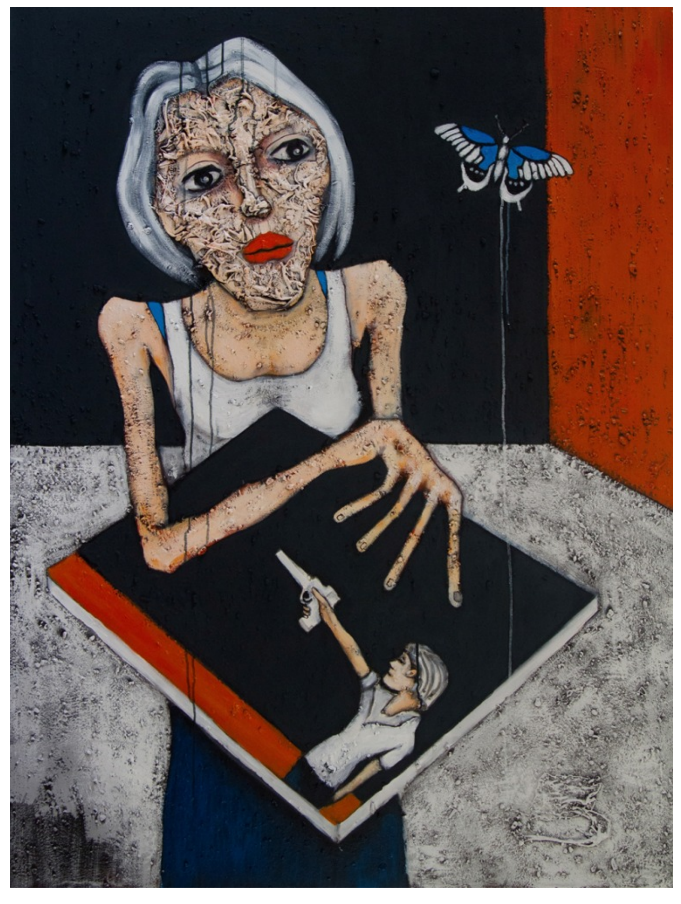
[7]Youssef Wahboun, the Gun, The French Institute, Rabat. 2019 Photography: Cécile Laroche-Coignet