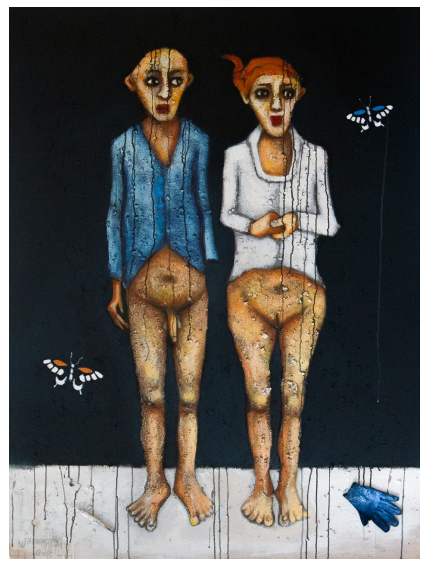
[1]Youssef Wahboun, the Needle, The French Institute, Rabat, 2019