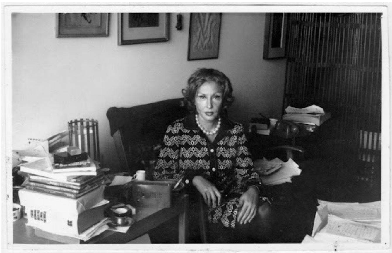
[1]Fig. 1: Clarice Lispector, Author unknown, undated © Acervo Clarice Lispector, Acervo IMS

Two small biographical rooms in the exhibition assemble press clippings, photos, and paintings, among them Giorgio de Chirico's portrait of Lispector from 1945, and her last TV interview recorded shortly before her death in 1977. (Fig. 2) To put the biographical sections in separate annexes on each floor was a wise curatorial decision that had allowed the viewers to focus on (various relations to) art: the group exhibition Constelação Clarice positions Lispector within the art scene of her time and opens new perspectives in view of her own art works and those that surrounded her. For the first time, we can see Lispector's writings situated.