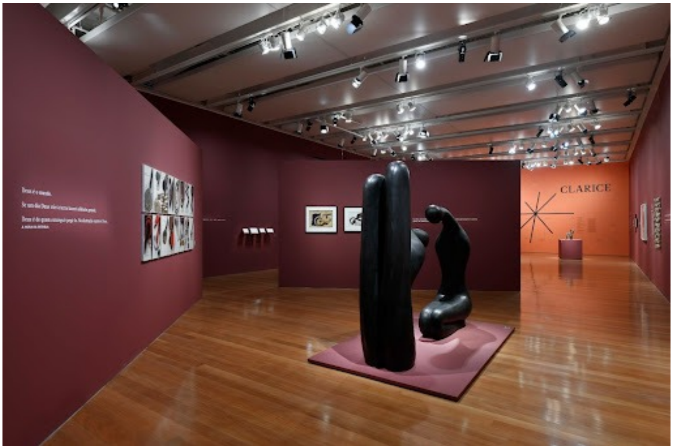
[12]Fig. 6: Constelação Clarice, Exhibition View