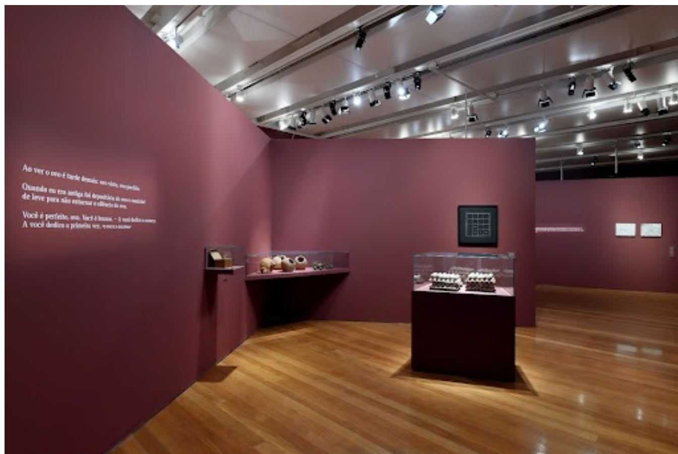
[18]Fig. 8: Constelação Clarice, Exhibition View