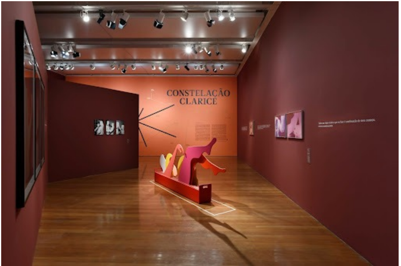
[14]Fig. 7: Constelação Clarice, Exhibition View