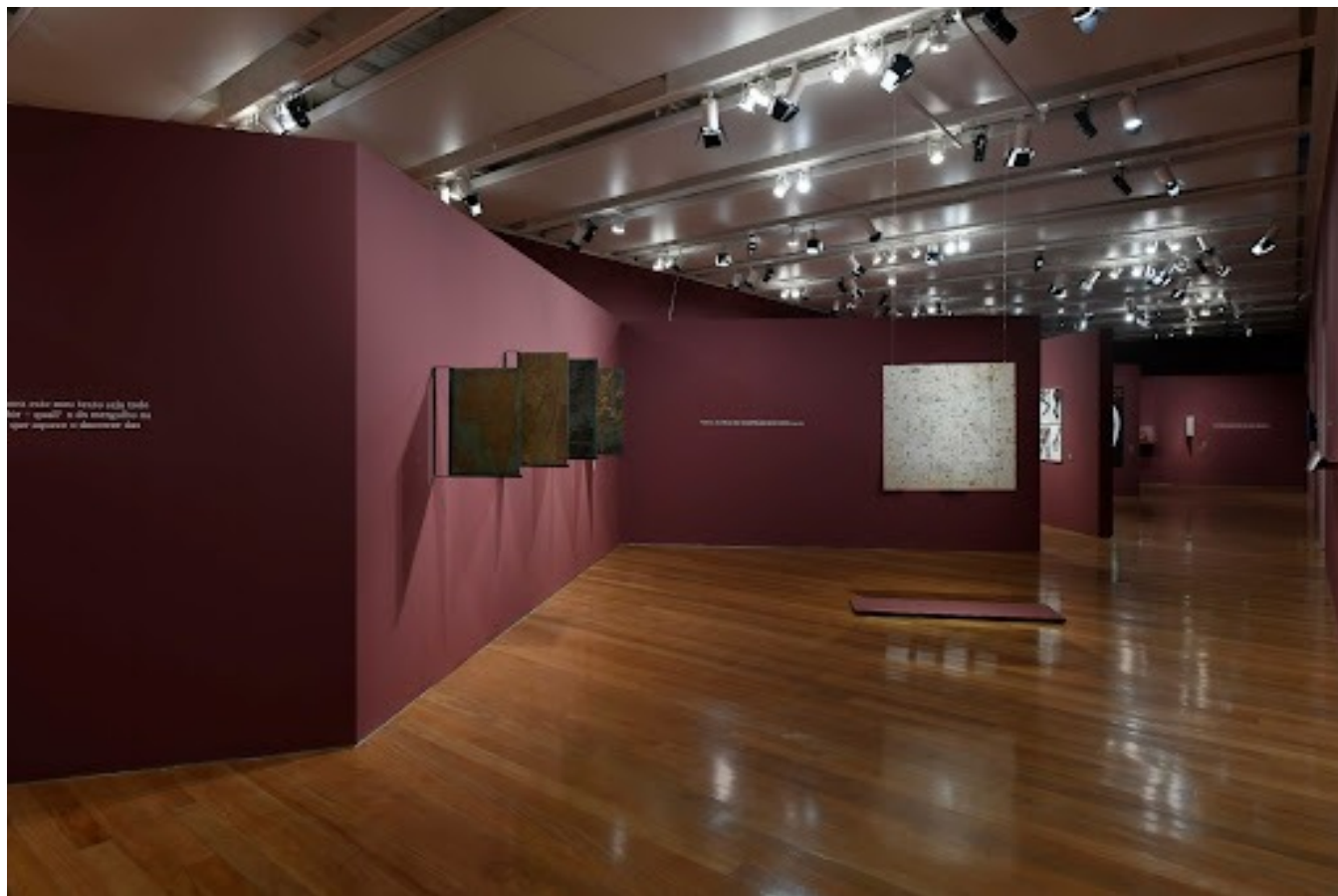
[10]Fig. 5: Constelação Clarice, Exhibition View