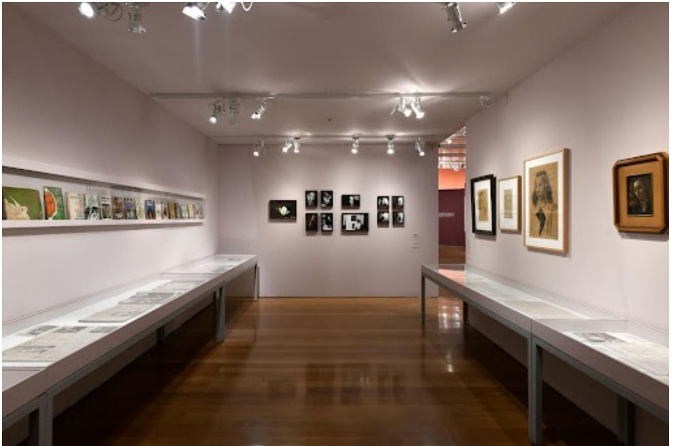
[3]Fig. 2: Constelação Clarice, Exhibition View