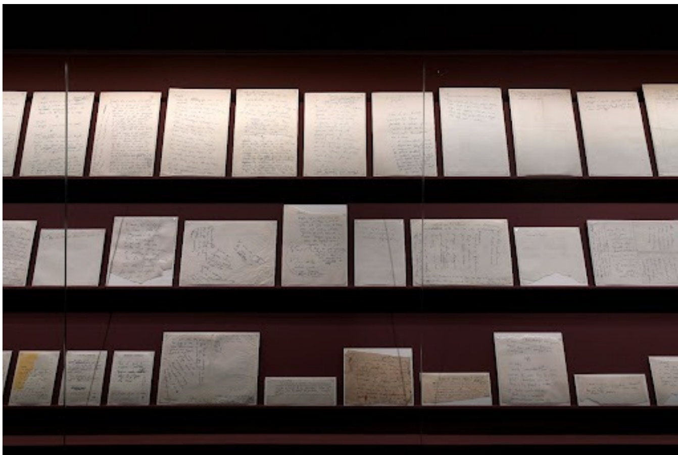
[5]Fig. 3: Constelação Clarice, Exhibition View