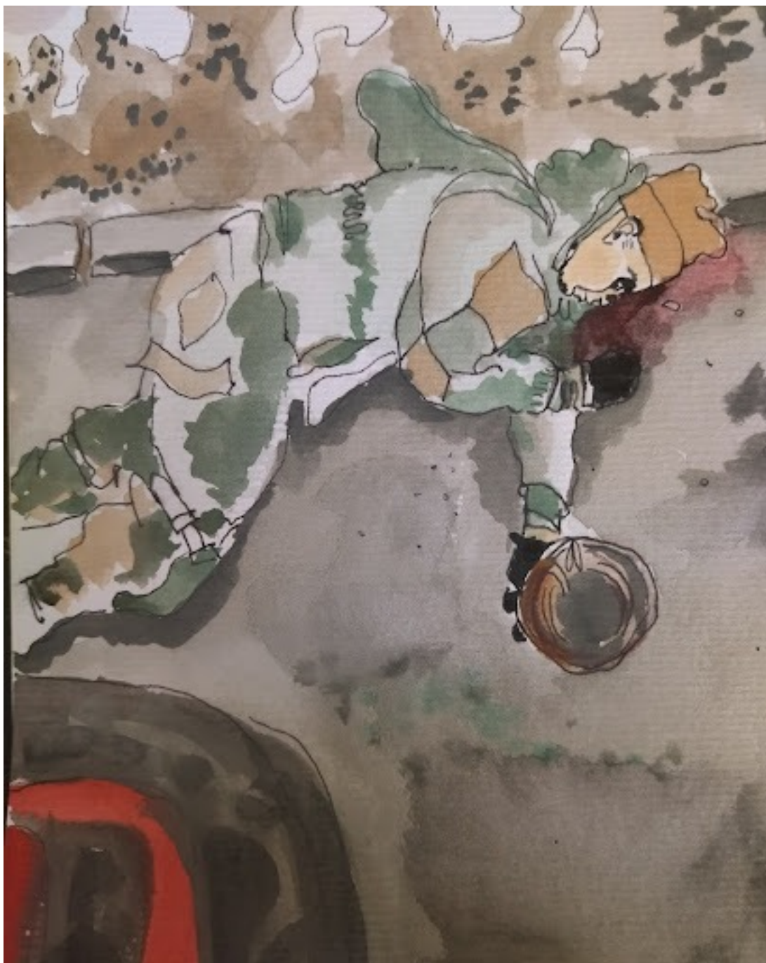
7.3.22, killed in Severodoneck, unidentified