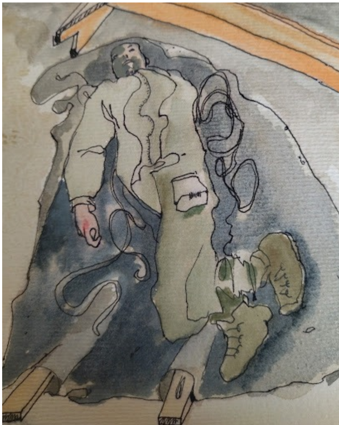
27.3.22, killed in Severodoneck, unidentified